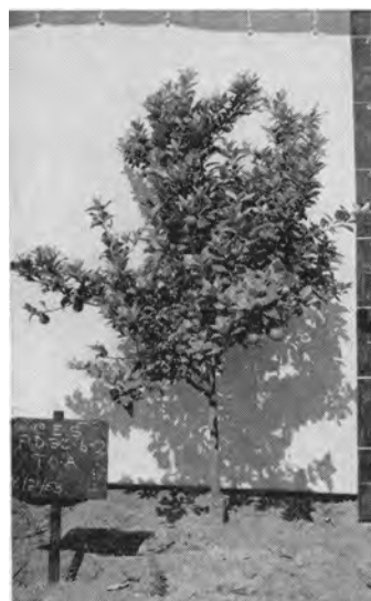
Trifoliolate orange stock in Treatment B. Note the extensive cracking and splitting of the trifoliolate bark.