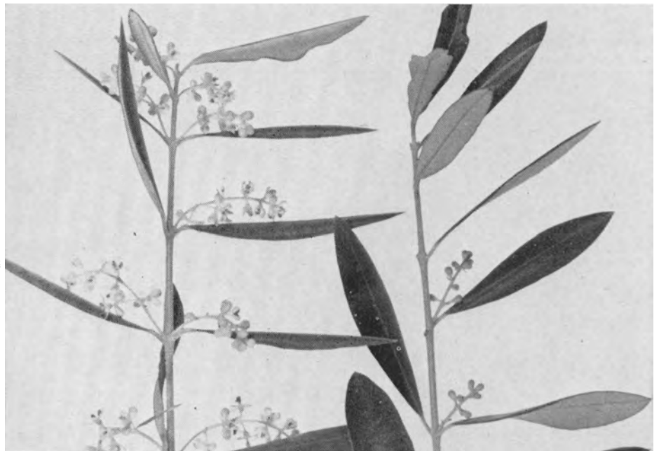
Left. Fruiting shoot from a Mission olive tree provided with ample soil moisture during flower development period—Group 1. Right. Shoot from tree maintained with just sufficient soil moisture to prevent wilting during the flower development period—Group 3.