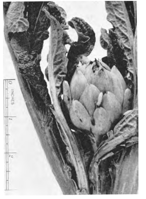
Artichoke showing damage caused by a larva of the plume moth, and a mature larva.

A knowledge of the seasonal cycle of this moth is important to a good chemical control as timing of applications is very critical. All stages of this moth can be found during every month of the year. The plants are usually cut off entirely, below the ground level, from April through June. Moths present in the fields at this time lay eggs on the new shoots.