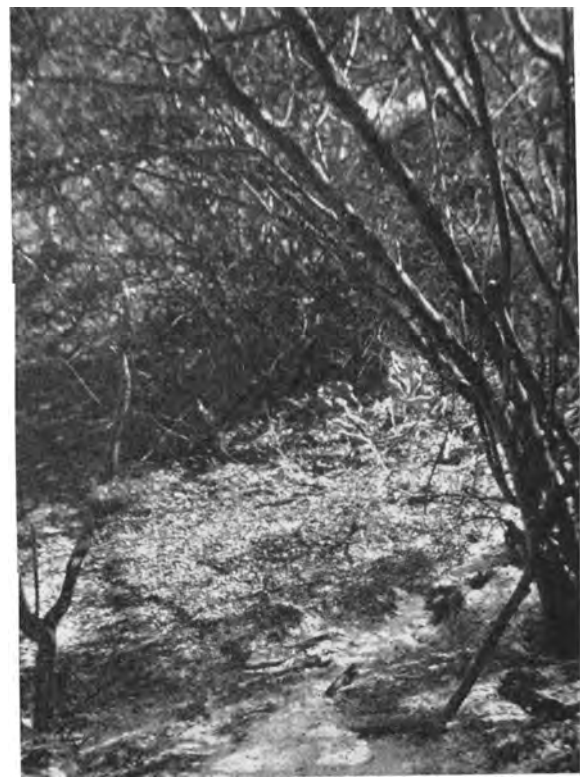
If conditions are not right for green brush and heavier fuels to burn, a fire merely consumes grass and other light, dead material and makes it difficult to run a fire through that area for another three to ten years.

Landowners burn for different purposes and expect various results. As an example, the 300-acre burn in Amador County, where a tractor was utilized in riling down brush to prepare for burning, resulted in an exceptionally effective burn, conducted during a period when danger of escape was low. The cost is high, but land which is to be put into grain can repay a fairly high clearing cost. On the other hand, 16 hours of tractor work on another brush field prepared the area for burning the brush standing. This was achieved safely and at a low cost. It could be considered an effective burn for the purpose of opening up an area for browse. Either of these burns could have been considered poor if predicted results had not been obtained.