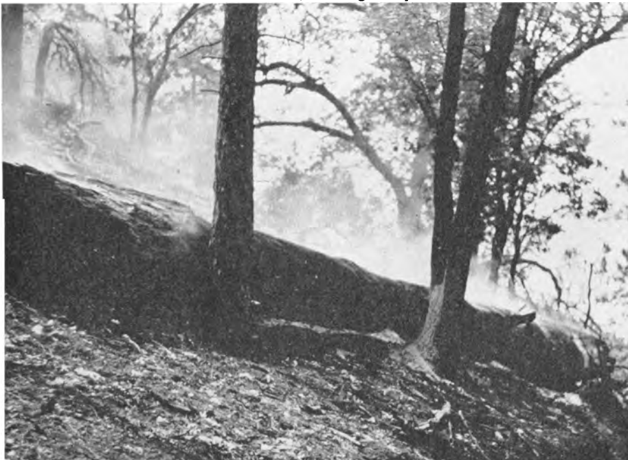
Burning log above firebreak. Chunks from such logs may roll across the fire line, causing escapes.

There are basic differences in vegetative cover, topography, soil, existing barriers to fire, and protection requirements of adjacent property values. These elements may exist in a pattern which reduces or increases effort necessary to burn. For example, 160 acres of chamise located in a remote area surrounded by roads or open fields presents minor problems in fire control and can be burned at low cost. Controlled burning of 160 acres of chamise located on a slope immediately below a stand of timber and surrounded by summer homes will provide a major problem in burning, and associated costs will be high.