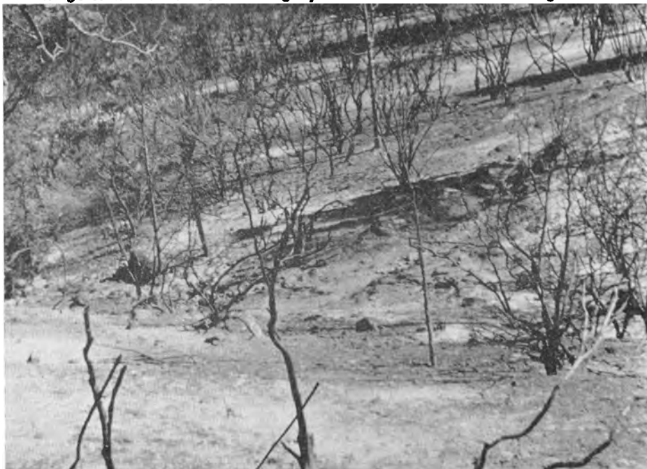
Range land cleared for seeding by successful controlled burning.

Each year 11% to 17% of the controlled burns for range improvement conducted in California escape and become wildfires. A study of 46 such escapes indicates the nature of factors which affects the safety of controlled burns.