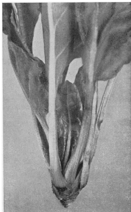
A beet cut off at the crown level by borings of the larvae.

The adult moth is gray with a wing expanse of about three-fourths inch, and the fore wings have two characteristic undulating transverse white lines. The elliptical, yellow eggs are laid singly on the petioles of the plants. Upon hatching the larva is one-eighteenth inch long and crawls down to the crowns where it starts