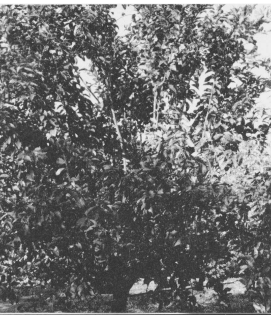
Right. Skeletonized lemon, photographed two years after pruning. Note the undesirable two-stage effect. Left. A deheaded lemon tree two years after pruning.