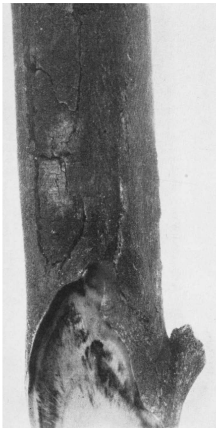
Wood pocket lesion on semidense Lisbon branch.