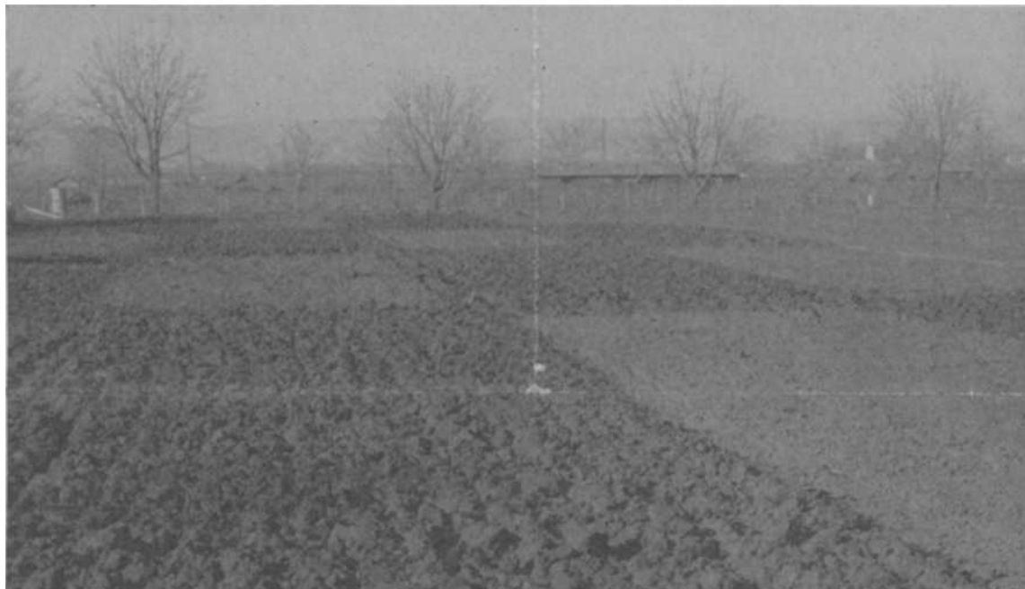
Partial view of the plowed and unplowed plots in the seed-bed preparation experiment. The rough land indicates the unplowed plots, later cultivated to finely pulverized seed-bed. The light areas indicate the plowed plots, which have been disked about two inches deep, floated, and made ready for seeding the crop.

Even though the plowed land had been harrowed and rolled, there was a tendency to deeper planting be-