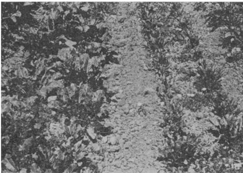
Sugar beets in a test field near King City. The larger, thrifty plants are on soil treated with 170 pounds of nitrogen per acre, applied as ammonium sulfate.

In 1945, when the field was again in sugar beets, it received 480 pounds of nitrate of soda per acre on April 15, as a side dressing. On June 24, 150 pounds of ammonium nitrate per acre were applied through the sprinkling system.