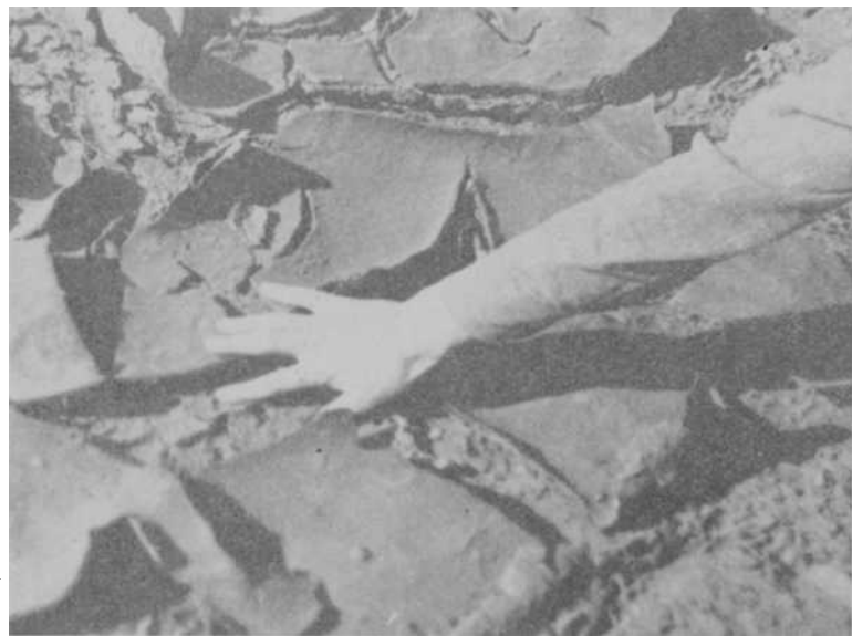
The waste solids remain as a thin layer on the floor of the disposal basin after the liquid disappears. As the layer dries, it cracks and curls exposing the surface openings of the soil to the air.

The pieces of curled residue will float when the next application of stillage is made. In the pilot scale testing, better than twenty applications were made to a basin without a serious reduction in the rate of percolation of the liquid into the soil but the dried cake accumulated to a considerable thickness.