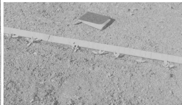
Field test followed laboratory experiments to prove the practicability of precision planting. Note the pencil and pocket notebook for comparative sizes in judging the regularity and spacing of the plants seeded by precision planting, rate of less than three pounds of seed per acre.

Following pilot field tests, a commercial planting of sugar beets was made on 80 acres near Davis, last season.