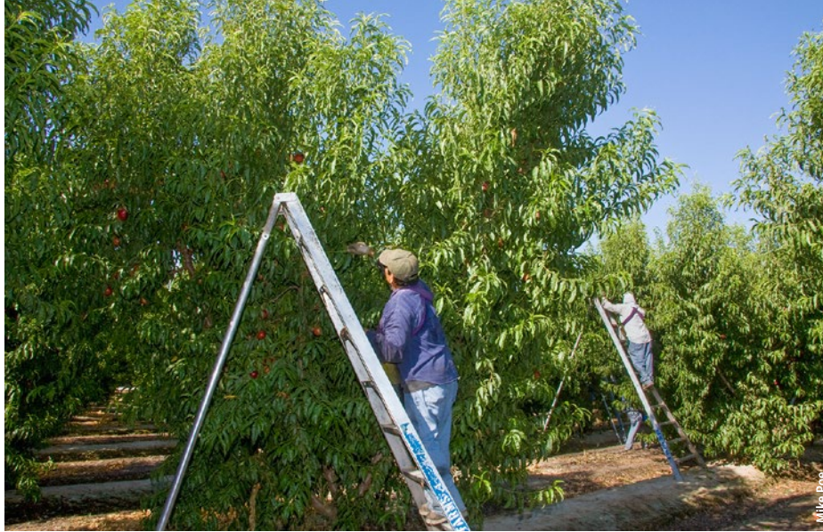
In 2014, the average earnings for workers in the fruit and tree nut farming sector were $17,600.

5613 employment services, 1113 fruits and nuts with another 1113 job, at least two 1151 crop support jobs, and 1112 vegetables with 1151 crop support.