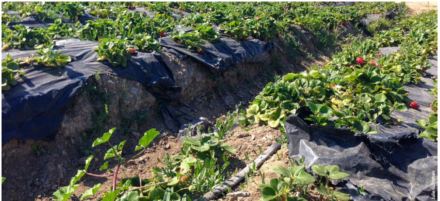
Methyl bromide has been used by growers since the 1970s to control soil pathogens, weeds and nematodes. Above, weeds and pathogen wilt in a Santa Cruz County field that was not treated with methyl bromide.

OEHHA and the DPR panel provided extensive comments on the draft document by the end of 2009. Both expressed skepticism about the chemical's safety and in their risk assessment reports concluded that the application of methyl iodide in field fumigation could result in significant health risks for workers and the general population (DPR 2010c; Lim and Nu-May 2010). Nevertheless, in April