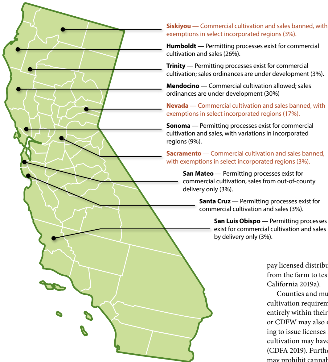
FIG. 1. Commercial cannabis cultivation and sales regulations in the 10 counties where growers participating in a survey reported growing cannabis, August 2018. Percentages indicate proportion of survey respondents per county ( n = 34 ). Three counties — Siskiyou, Sacramento and Nevada — do not allow commercial cultivation aside from exemptions in unincorporated regions. Sources: Humboldt County 2019; Mendocino County 2018; Nevada County 2018; Sacramento County 2018; San Luis Obispo County 2018; San Mateo County 2018; Santa Cruz County 2018; Siskiyou County 2018; Sonoma County 2018; Trinity County 2018.

The cultivation licensing system was broadly intended to facilitate cannabis growers' entrance into the legal market while protecting public safety, limiting environmental impacts and preventing the distribution of illegally grown cannabis. However, the extensive cultivation and reporting criteria, coupled with