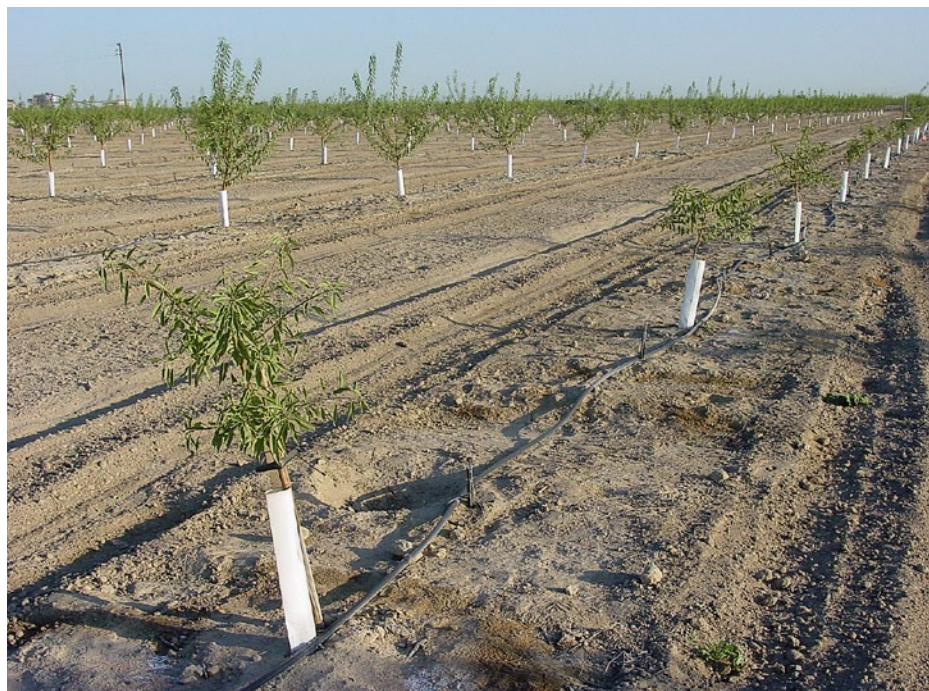
First-year impact of Prunus replant disease at the Firebaugh replant trial; stunted trees in the foreground row were planted in plot of nonfumigated replant soil, while trees in the background rows were planted in preplant fumigated soil.

In each orchard, all preplant soil fumigation treatments were applied by TriCal Inc. (Hollister, CA) to plots that would accommodate a width of three tree rows (66 feet) and a length of 10 tree spaces (140 to 170 feet). The MB treatments were applied with a conventional MB rig (TriCal Inc.), and the system injected fumigant at soil depths of 18 to 20 inches through two shanks spaced 60 inches apart; one pass was made for each tree row, effectively treating a 10-foot-wide strip. The other fumigant treatments were applied with a Telone rig (TriCal Inc.), which also injected fumigants at soil depths of 18 to 20 inches, but through three or five shanks (depending on the treatment). The shanks were spaced 20 inches apart and tipped with horizontal "wing" attachments. Fumigant was released from two points 8 inches apart, one behind each wing tip. The rig was used to apply three types of treatments: single-pass strip treatments, in which fumigant was