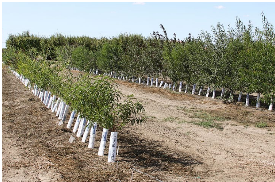
Rootstocks for almonds and stone fruits were tested for their resistance to the Prunus replant disease complex near Parlier, CA. Shown are a plot of PRD-affected rootstocks in nonfumigated replant soil, left, and a plot of relatively healthy rootstocks grown in soil preplant fumigated with 1,3-D:Pic 63:65 (Telone C35), right.

Approximately 1 million acres of California's best agricultural land are devoted to production of almonds and stone fruits (USDA 2011), and sustained high production from this land requires that the orchards be replanted every 15 to 25 years, depending on the production