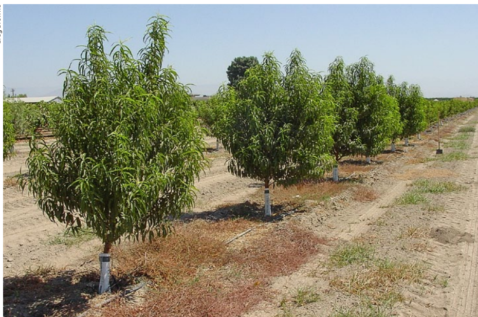
In the first growing season of the peach replant trial near Parlier, peach trees planted in preplant fumigated plots grew well ( above , shown are trees in plot strip treated by shank injection of 1,3-D:Pic 63:35), while the peach trees planted into nonfumigated control plots grew poorly due to the PRD complex, below .