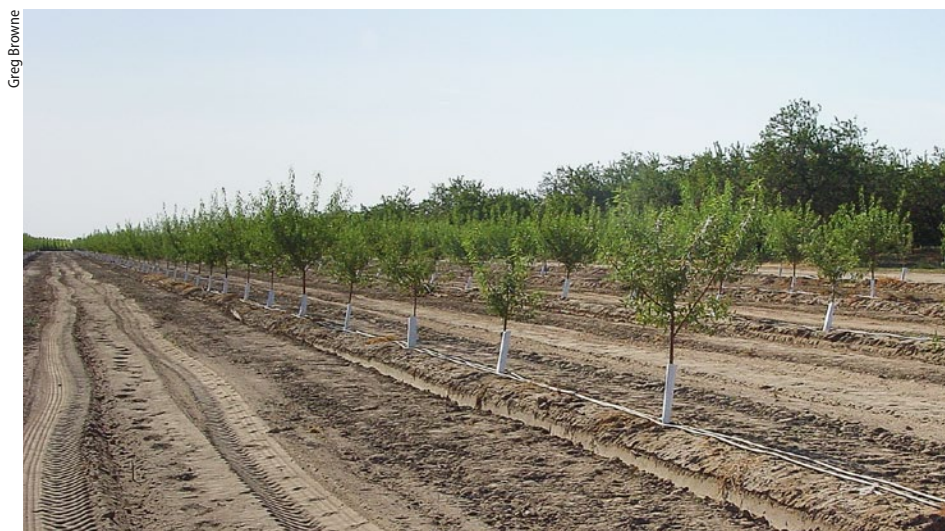
First-year impact of Prunus replant disease at the Madera replant trial; stunted trees in the foreground were planted in plot of nonfumigated replant soil, while larger trees in the background of the same row were in plot of preplant fumigated soil.

Across both trials, the strip treatments with Pic and combinations of 1,3-D:Pic (63:35 and 39:60) generally afforded greater net returns than other treatments. Although the GPS-controlled spot treatments generated lower net returns than some of the strip treatments, the spot treatments provided greater returns than the strip treatment with 1,3-D alone, which has been an almond and stone fruit industry standard. In terms of dollars of net revenue per pound of fumigant, the spot treatments were generally more efficient than strip or full-coverage treatments (table 1). When a net price of $1.70 per kernel pound was assumed (instead of $2 per pound, for the sake of comparison), all of the MB-alternative treatments