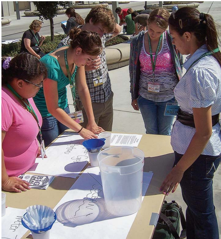
The 4-H curriculum There's No New Water! was developed in response to ANR's Strategic Vision 2025, and it is guided by National 4-H Science literacy goals and strategies. During a workshop at UC Merced, 4-H members simulate the pathways raindrops may traverse through a watershed.

Research has revealed, however, that scientific literacy in the United States is low. Miller (2006) found that only 28% of U.S. adults have a level of scientific understanding necessary to function as citizens in modern society, and scientific literacy among young people is also undesirably low. Nationally, assessments have shown stagnant or declining science scores among school-age youth. The