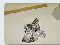
b. Loosely crumple the foil.