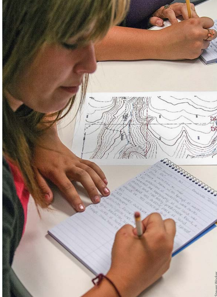
Youth work with topographical maps to learn how the impact of pollutants varies depending on the natural landscape and types of human activities.

The 20 questions on the second survey related to life skills, including wise use