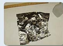
c. Gently pull out all four corners of the square.