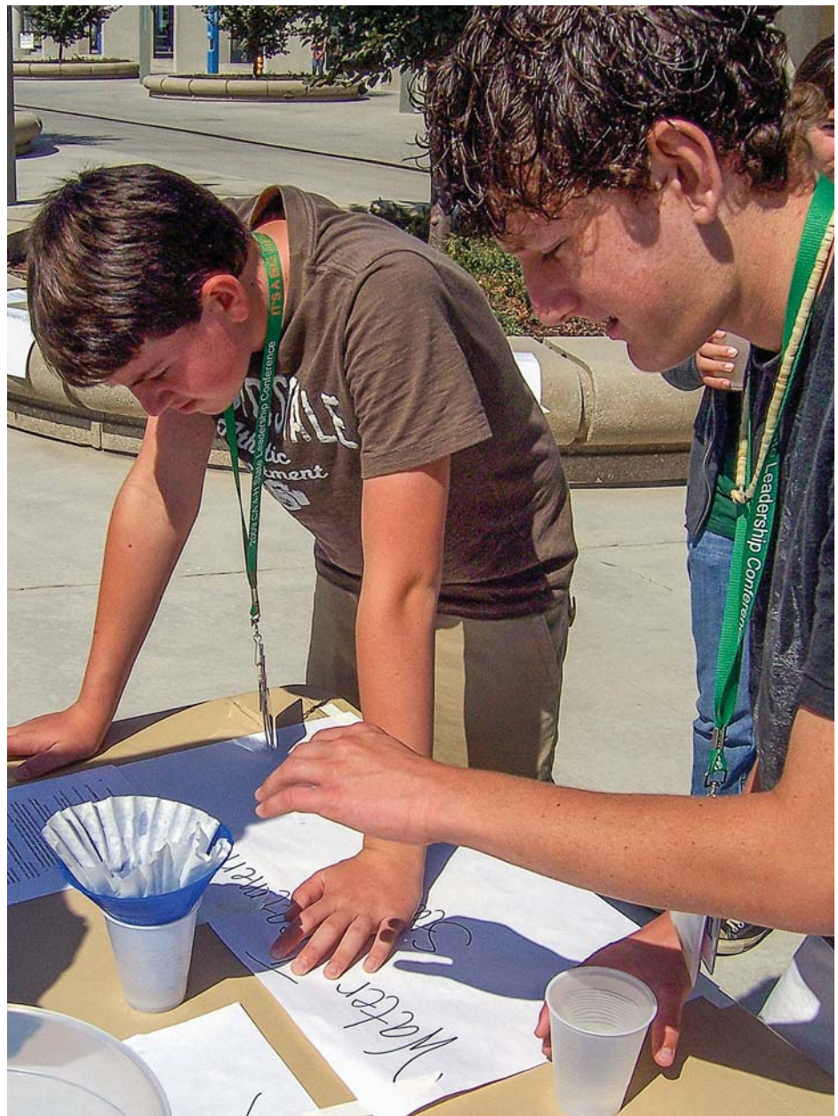
Participants at the “water treatment” station learn that wastewater must be treated for harmful pathogens, toxins and organic matter that can have damaging effects on human health and the watershed. There's No New Water! includes a module to help youth identify local water concerns and develop a program to address them, activities shown to increase interest in science.

A school enrichment program was used to pilot test There's No New Water! and collect preliminary outcome data. School enrichment programs are often used to implement 4-H youth science programs (Kahler and Valentine 2011), which have been shown to provide experiential education opportunities in school