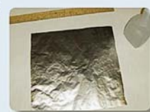
a. Square piece of aluminum foil, approximately 12" x 12" (30.5 cm x 30.5 cm).