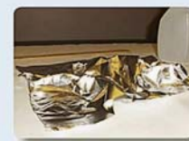
d. The foil should return to its approximate square shape, but have some "peaks and valleys" that represent different land forms.

In the "Going With the Flow" activity, youth simulate a landscape using aluminum foil and predict how water drains through the watershed.