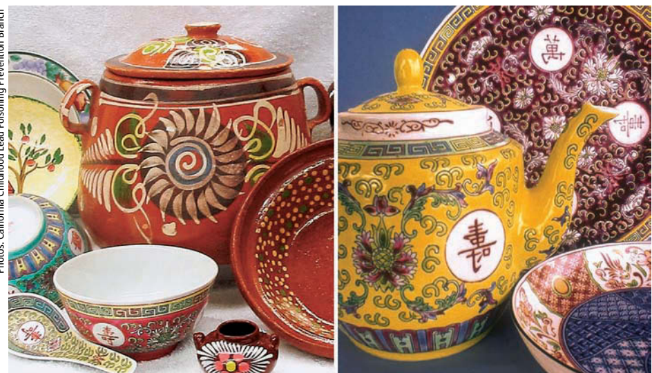
Imported ceramic cookware may contain high levels of lead in the decoration. Lead leaches into food during cooking and storage, especially with acidic foods.

Soil becomes contaminated with lead through three methods: the weathering and chipping of lead-based paint, industrial pollution or deposition from the use of leaded gasoline. EPA regulations have greatly reduced the risk of lead exposure from industrial pollution or the use of leaded gasoline, but exposure to leadbased paint continues to be a problem.