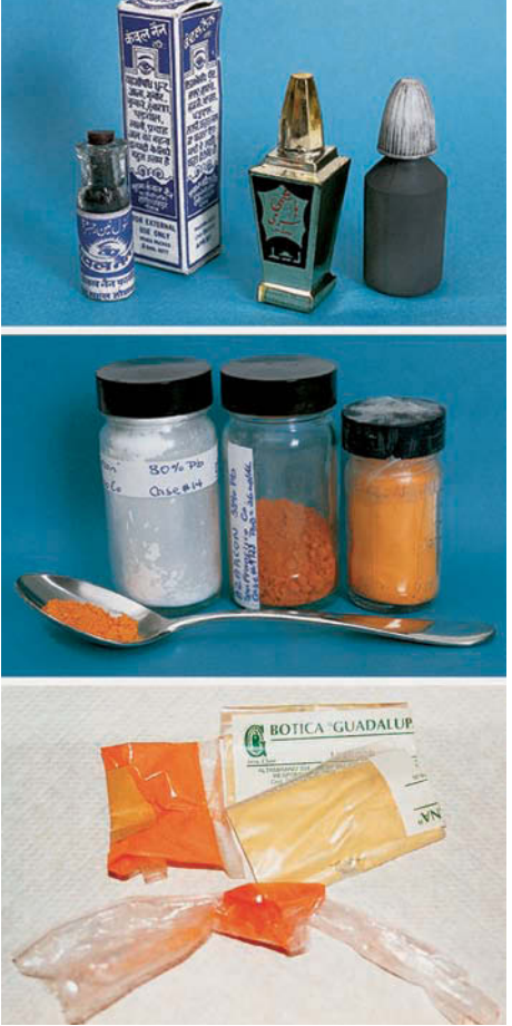
Large amounts of lead have been found in certain ethnic remedies. Top , surma or kohl is applied to children's eyes in some Asian communities. Center and bottom , azarcon and greta are used to treat intestinal and stomach ailments in some Latino communities.

Our review suggests that elevated levels of lead occur in paint, dust, soil, imported pottery and ceramic ware, ethnic remedies, and some imported candies. Furthermore, although the monitoring of lead levels in candy should continue, current data suggests that in the United States the risk of lead toxicity from these items is relatively low. If future analysis shows lead contamination of such food