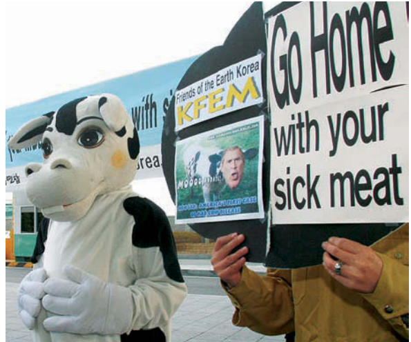
Left, a Canadian rancher herded healthy calves in southwestern Alberta; Canadian authorities have reported three cases of mad cow disease since 2003. Above, on Dec. 30, 2003, protesters met a U.S. delegation arriving in Seoul to discuss mad cow disease with South Korean officials; South Korea banned U.S. beef imports following the discovery of the first confirmed U.S. case.