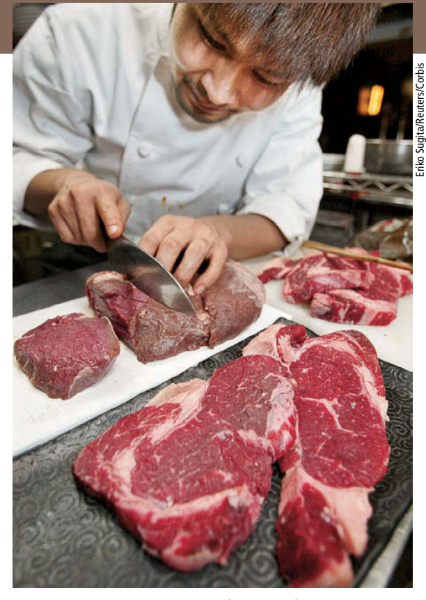
Japan, the world's top buyer of U.S. beef, suspended imports in late December 2003, after the U.S. confirmed its first case of mad cow disease. On Dec. 24, 2003, a Japanese chef sliced imported U.S. beef at a Tokyo restaurant.

The second U.S. BSE case may also hasten parts of the testing program that are planned but have not yet been implemented. For example, in addition to testing downers and cows with BSE