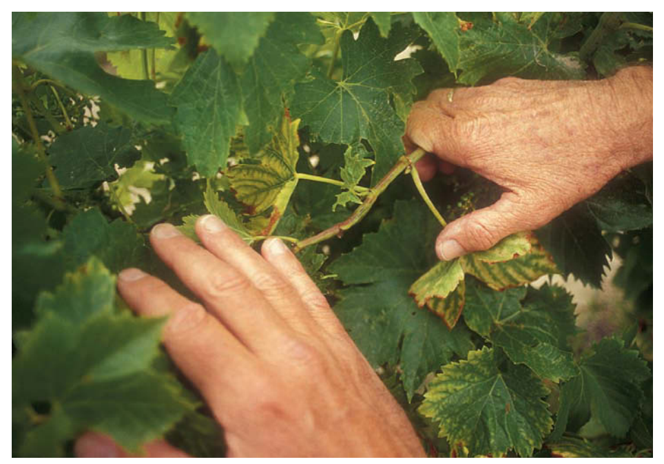
Boron-deficient vines have, facing page, bottom, clusters that set numerous shot berries, small berries with a distinctive pumpkin shape; or, facing page, top, calyptras that stick on young, developing berries. Above, shoots have shortened and swollen internodes, and shoot tips sometimes die.

The goal of boron fertilization of grapevines is to keep tissue levels within a narrow range, since both deficiency and toxicity can have serious negative effects on vine growth and production.