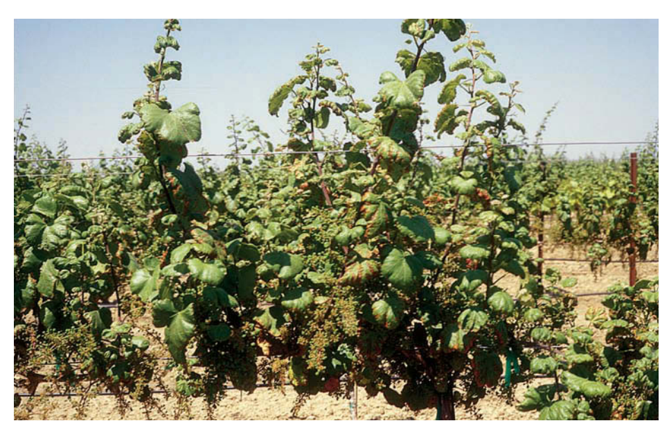
Symptoms of boron toxicity include leaves that are cupped downward with necrotic margins on mature leaves.

The results of this research can be applied to other drip-irrigated vineyards in the San Joaquin Valley under similar conditions: rapidly drained soils, highquality irrigation water, and low boron content in soil, water and vine tissue. In other regions of the state where winter rainfall is much higher, there would presumably be more leaching of boron fertilizer during winter months and less carryover time after fertilization is discontinued. In contrast, less leaching and greater carryover of boron would be expected in areas of less rainfall or on soils with finer texture and higher water-holding capacity. The amount of boron fertigation used in a maintenance program will vary with leaching potential. These variables underscore the importance of monitoring boron in tissue when developing a long-term fertilization program.