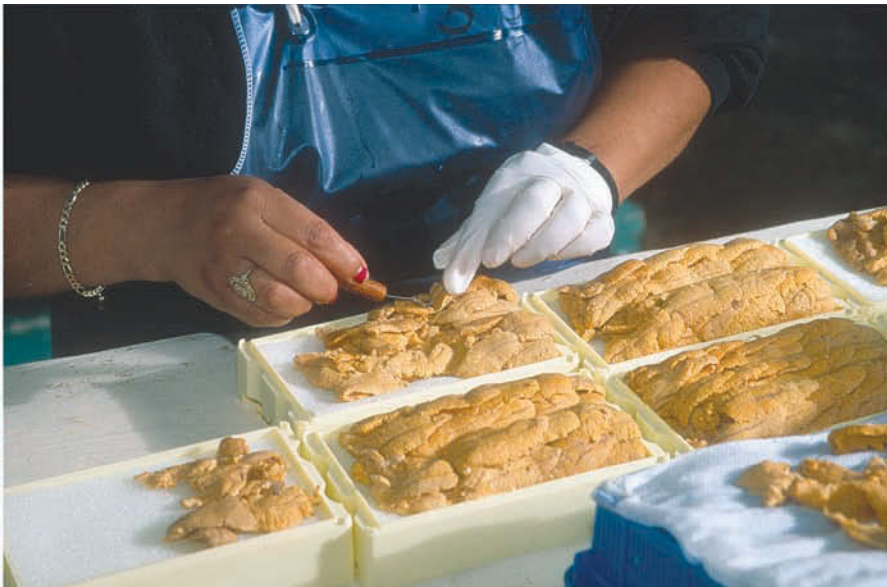
Because the California sea urchin industry was willing to work collaboratively with regulators and scientists, valuable monitoring data is being collected, which could inform a future fishery-management plan. Left, A sea urchin diver vessel in the Santa Barbara channel. Right, Sea urchin gonads are packed for shipment to Japan in a San Diego processing plant.