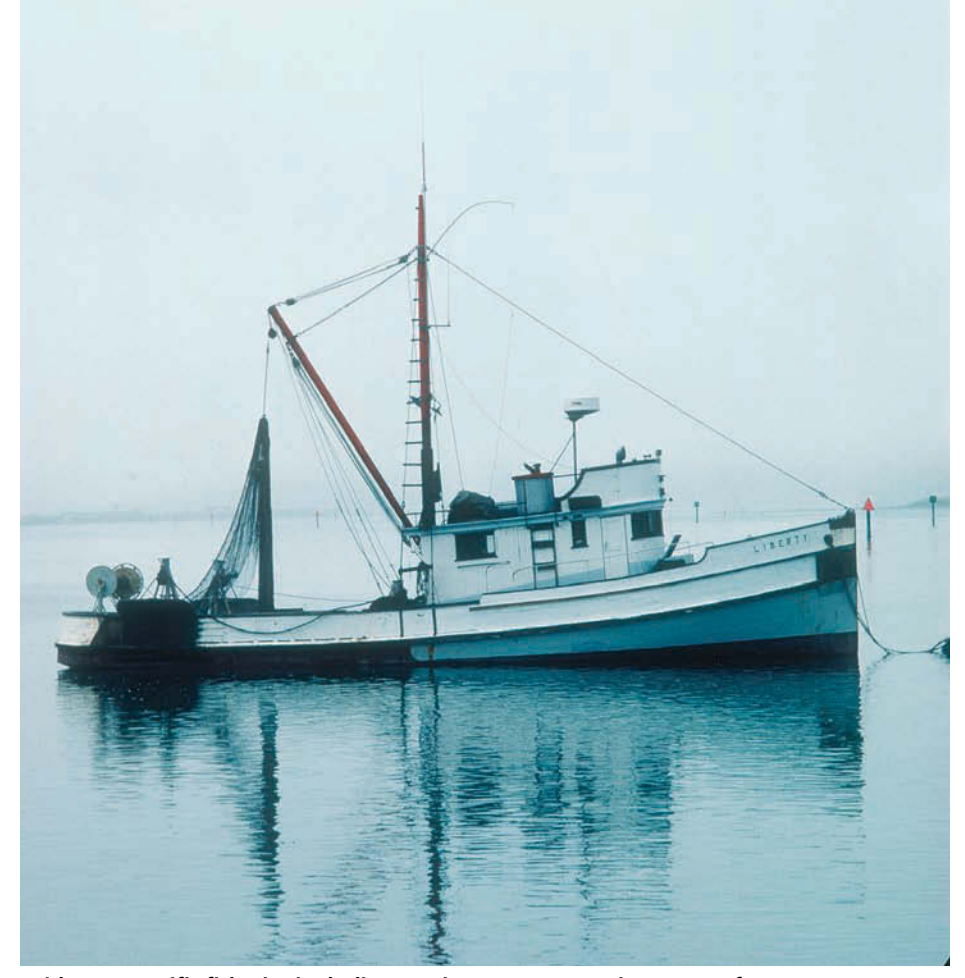
With some Pacific fisheries in decline, marine management issues are often contentious. In Bodega Bay, an old trawler rests on its mooring.

arine fisheries nationally and in California have a long history of producing significant commercial and recreational benefits. Commercial fishing is the last significant industry where participants hunt and harvest wild organisms. Fisheries resources