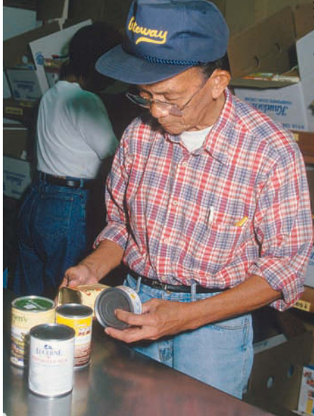
Participants in the focus groups strongly supported the labeling of foods as genetically modified. Many wanted to know the source of the DNA as well as nutritional comparisons with the unmodified food.

The support we found for labeling is even more surprising given the high percentage of participants who were Latino with relatively low English proficiency. Four of the focus groups were