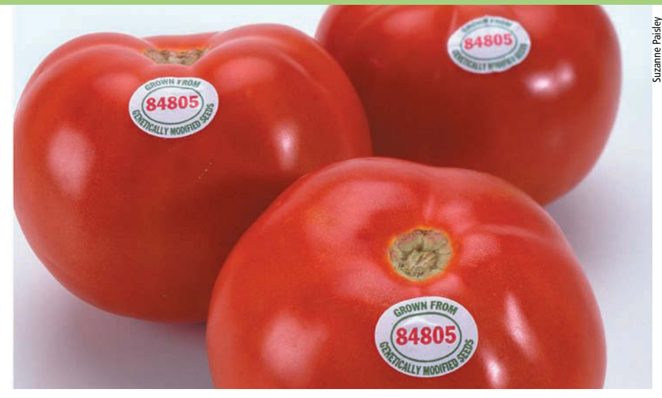
Controversy over genetically modified foods erupted with introduction of the Flavr Savr tomato, above , in the mid-1990s, and continued as new products were introduced into agriculture and the food stream. Nonetheless, only about 15% to 20% of the low-income consumers in focus groups were familiar with the concept of agricultural biotechnology.

Beginning in about 1994, the arrival and proliferation of genetically modified (GM) crops and foods in U.S. markets sparked a public policy controversy. Advocates say that agricultural biotechnology offers potentially substantial benefits, such as decreased susceptibility to crop damage from insects or disease, increased nutritional value, and a more plentiful supply. But critics of GM foods express concerns about the possibility that genetically altered organisms could have long-term negative impacts on an already precarious ecological balance (Brown 2001). Others raise concerns related to food safety, such as that milk produced from dairies using rbST will have higher trace levels of antibiotics, thereby increasing antibi-