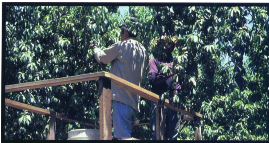
Pheromone dispensers can be placed in the tree using ladders or from a truck, above. Costs for various application methods were measured.

Nonetheless, in Merced County one block caught 228 peach twig borer moths in mating-disrupted orchards and subsequently had substantial damage, indicating that mating disruption was no longer occurring. The populations of peach twig borer are