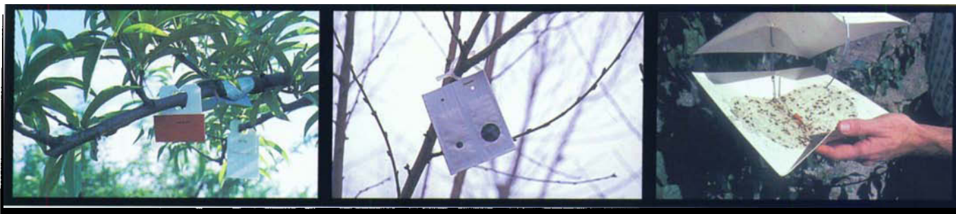
In a demonstration project, cling peach growers in the Sacramento and San Joaquin valleys were introduced to pheromone disruption as a method to control oriental fruit moth and peach twig borer. Several different commercially available products were tested, left and center. Right, A pheromone trap is used to monitor pest levels in the orchard.

each species to determine the application timing.