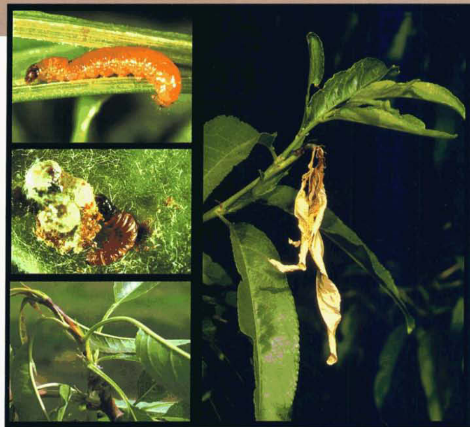
The major pests of cling peaches are oriental fruit moth, upper left , and peach twig borer, left middle . These pests can bore into the terminal of the leaf, lower left , and cause it to wither and die, right . Broad-spectrum insecticides are effective in controlling these species, but can cause other problems such as insect resistance and secondary pest outbreaks.

Most insecticides applied to cling peaches target two key insect pests: oriental fruit moth and peach twig borer. Both are lepidopteran pests that infest the fruit as it matures. Broad-spectrum toxic pesticides such as azinphos methyl, permethrin and esfenvalerate are effective in controlling these species. However, they have other problems such as contamination of surface water due to runoff from orchards, field-worker and pesticide ap-