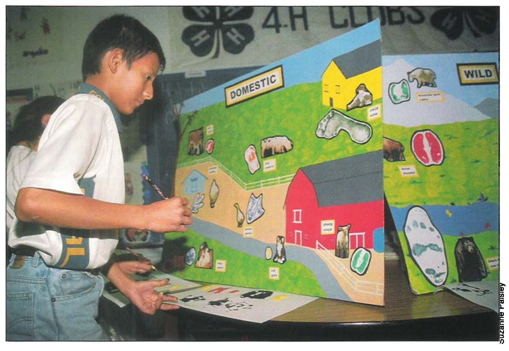
The Animal Ambassadors program, created by Veterinary Medicine Extension, is an example of how UC can better serve children by encouraging meaningful developmental

be encouraged among groups that do not share a history or culture of participation?