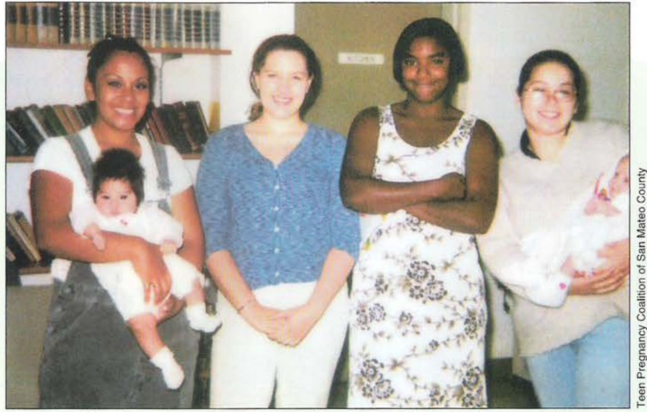
Members of the Teen Pregnancy Coalition of San Mateo County visit area middle and high schools to share the realities of teen parenting with students.