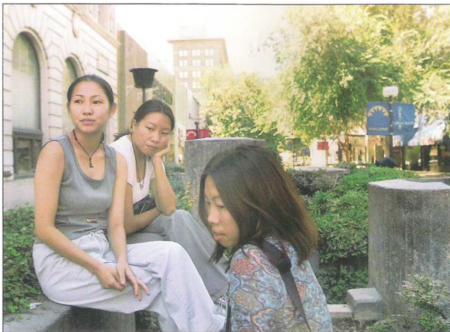
With changes in family structure and increased work demands on parents, young people are spending more time unsupervised. By 2025, California will have 14.5 million children under 18 such as these Suisun City teenagers, left, and Fresno teenagers, above.

pregnancy, substance abuse, or school failure and dropout), more people are beginning to imagine youth as resources for their families and communities.