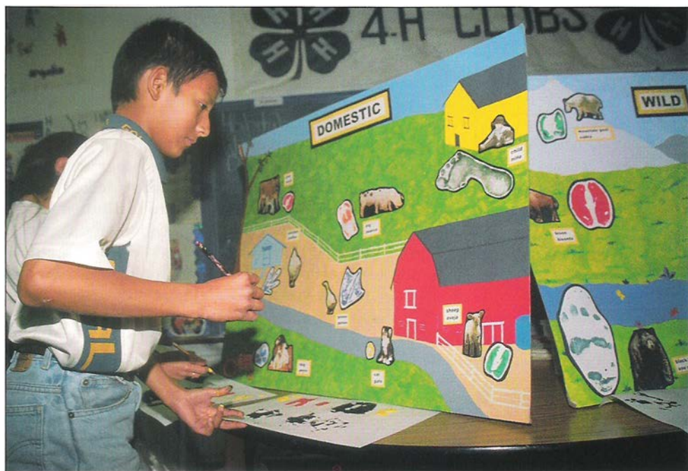
The Animal Ambassadors program, created by Veterinary Medicine Extension, is an example of how UC can better serve children by encouraging meaningful developmental activities.

be encouraged among groups that do not share a history or culture of participation?