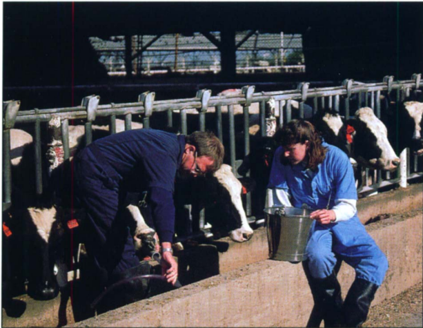
Veterinary extension specialists advise livestock producers on disease prevention, production quality control, food safety and animal well-being. Here a student and her instructor examine a cow on a ranch near Davis.