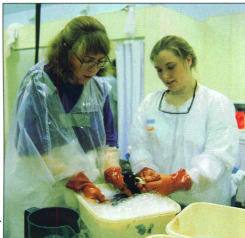
The Oiled Wildlife Care Network has 21 member organizations that respond to oil spills, rescuing and rehabilitating injured marine mammals and seabirds.

With advances in companion animal care, pet owners began to demand veterinary services as sophisticated and extensive as could be found in human medicine. More students began to specialize in this area. Today, up to 70% of veterinarians are involved in treating small companion animals.