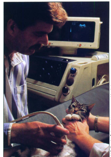
UC Davis School of Veterinary Medicine

Specialized earphones are used to test a Dalmatian puppy's hearing.