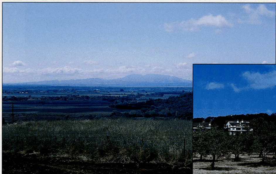
Above, overview of the Suisun Valley. At right, housing development next to a Suisun Valley walnut orchard.