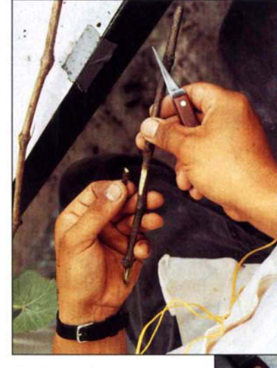
Until recently, the woody indexing test was the only reliable method of detecting leafroll disease. A small chip bud from the vine, above , was grafted to a grape leafroll indicator host, 'Cabernet Franc', right .

The authors wish to thank the Prune Marketing Board for financial support of this research.