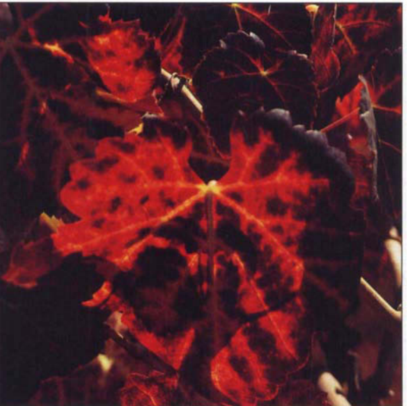
The red color in this Napa Valley Cabernet Sauvignon's leaves in the fall is caused by leafroll disease.

In the fall of 1992, one vine of each of the registered selections at the FPMS was tested by ELISA for GLRaV types II, III and IV. Each of these selections was propagated from a single grapevine of a valuable variety or from a clone that qualified as foundation stock. The test provided a first survey of the GLRaV ELISA status of the foundation vineyard. The preliminary results indicated that about 20% of the tested vines were infected with at least one of the leafroll-associated viruses. All the ELISA-positive vines were in the old foundation vineyard, which is about 25 years old. Originally the planting in this vineyard was a mixture of healthy registered vines and vines infected with closteroviruses, including the GLRaVs. A mixed planting of healthy and virusinfected materials was allowed because the accepted assumption at the time was that the grapevine closteroviruses do not spread from vine to vine. In contrast to the old foundation vineyard, no ELISA-positive vines were found in the more recently established foundation planting known as Brooks vineyard; this planting contained only registered vines. No vines that were known to be virus infected were included when this vineyard was propagated. Most of the vines in Brooks vineyard had originally been