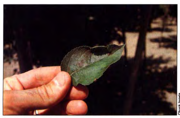
Clockwise from above : Overall damage due to apple scab was 86% higher in the organic system. Scab lesions damaged fruit, contributing to yield losses. Checking under a cardboard band wrapped around the tree trunk was one way of monitoring codling moths. Organically grown apples, like this Golden Delicious, suffered more codling moth damage.