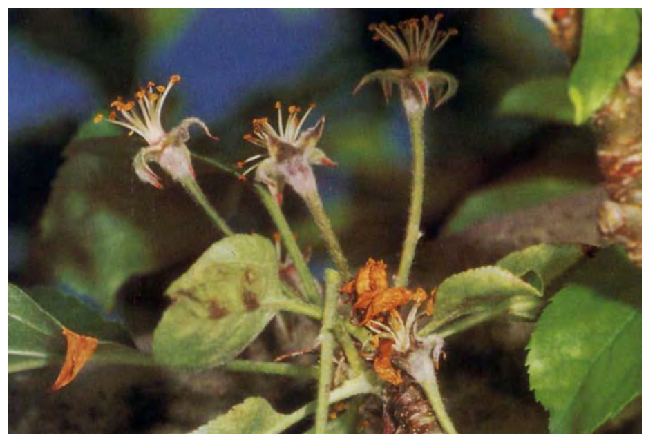
Early season scab infection caused blossom drop, which accounted for most of the yield loss.

Juice prices were used to calculate returns for the conventional fruit because that is how it was actually sold. Much of the conventional fruit, however, did make fresh market grade. It could have been sold at a higher price,