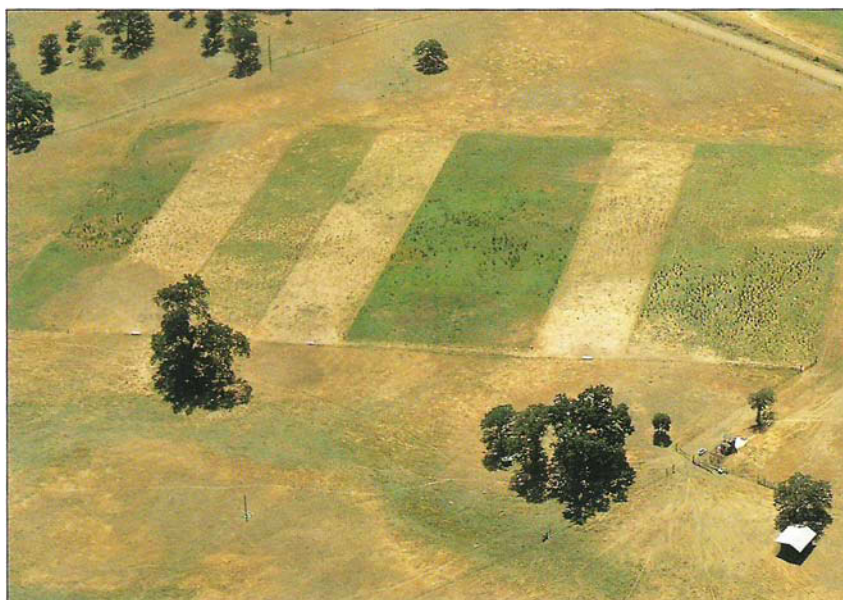
At Arrowhead Ranch in Colusa County, July 1992, paddocks 2, 4 and 7 (left to right) show the effects of cattle grazing on removal of yellow starthistle. The other paddocks (controls), characterized by green vegetation, are dominated by yellow starthistle. The darker green clumps are hardinggrass. The area outside of the experimental paddocks is continuously grazed during spring and summer and also shows starthistle reduced by cattle grazing.

Grazing by sheep and goats was tested on the Agronomy Farm at UC Davis to compare starthistle responses to grazing at the early (rosette) and late-season (bolting) stages. Along with a large component of starthistle, resident vegetation included annual grasses and