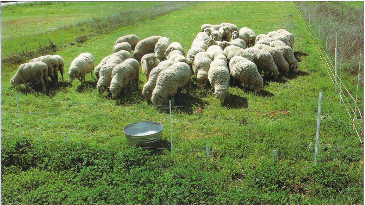
Flock of 40 ewes graze yellow starthistle during rosette stage of growth, UC Agronomy Farm, March 1990.