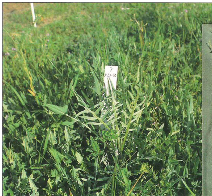
Rosette stage of growth observed in March 1990. Inset: Portion of tap root is seen in rosette stage of growth.