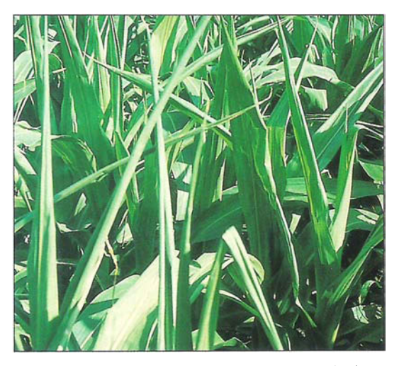
Drought-stressed corn showing curled leaf response.

A microcomputer program, ACRE, calculates the number of acres of field and row crops to plant, given a limited water supply. Inputs include crop water balance parameters and the anticipated supply of irrigation water. This program is useful for determining how many acres to plant when the goal is to avoid the kind of water stress that impairs marketable production of a crop.