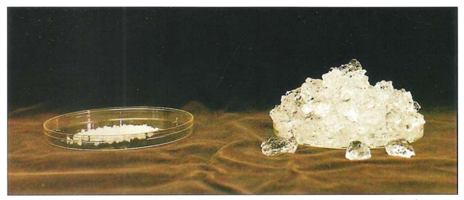
Dry polymer crystals on the left contrasted with same crystals after 130 ml of water have been added.