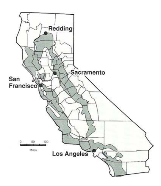
Fig. 1. Composite distribution of blue oak, valley oak, Engelmann oak, interior live oak, and coast live oak (Griffin and Critchfield, 1976) in which 305 municipalities were surveyed.

Regulations, incentives and educational programs, according to a new study, appear to be the most effective combination of strategies needed to maintain California's native oaks in municipalities.