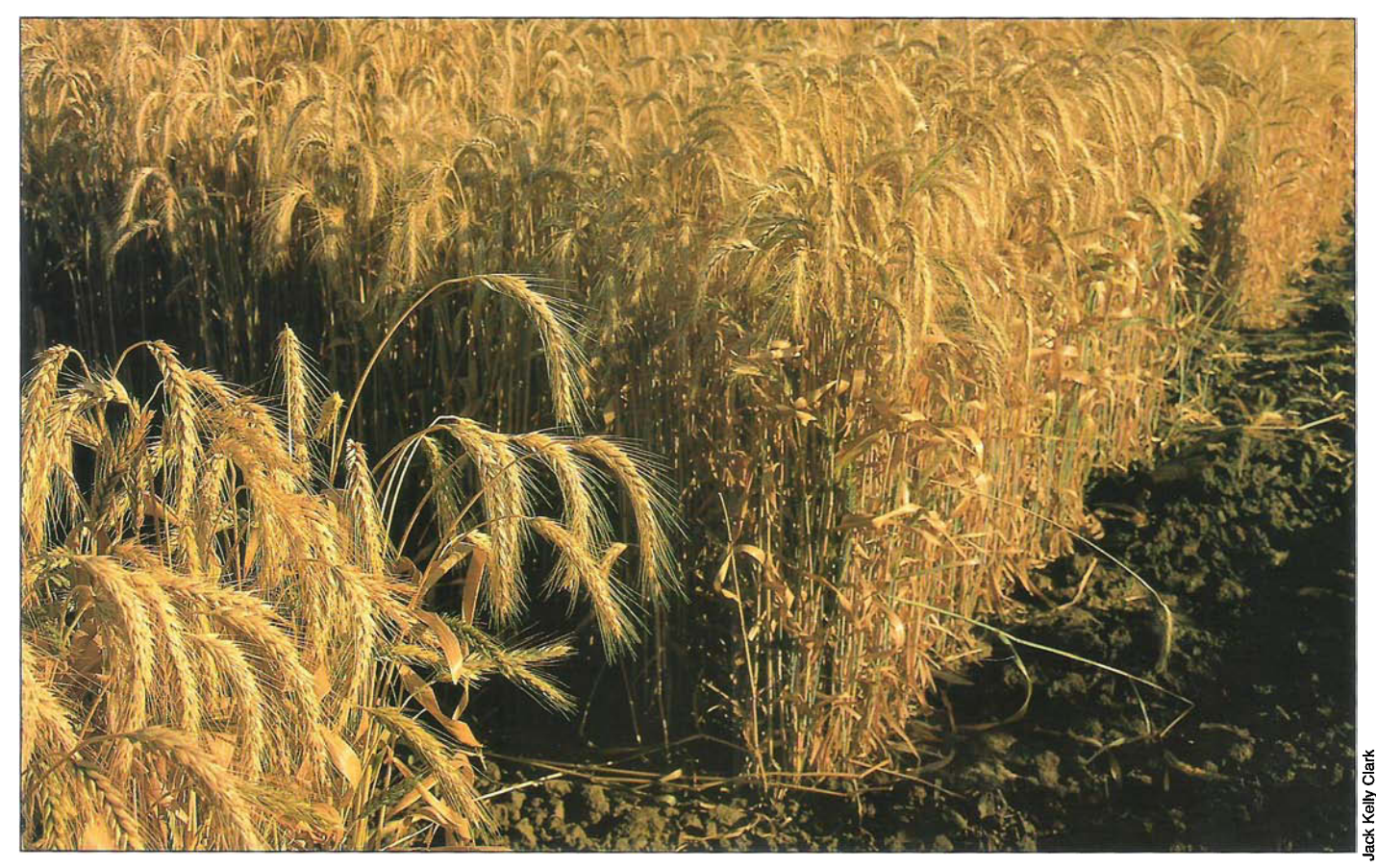
Field of triticale, a hybrid of wheat and rye.

ing at $4.50/100 lb even if its protein content were as low as 10% when its economic value would still be $4.73/100 lb. Of course, feed prices vary and this analysis illustrates the approach to be taken when considering the inclusion of triticale into poultry diets. For the circumstances of this research, triticale.appears to be a viable alternative on both nutritional and economic grounds as a poultry feed ingredient.