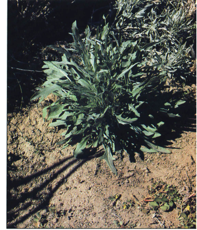
Ability to regrow following harvest improves the commercial prospects of guayule. The plant above shows vigorous regrowth 60 days after being cut at ground level. Guayule field at left is one year old.

To succeed as a commercial crop, guayule must become more productive and the prohibitive cost of stand establishment by transplanting seedlings must be reduced. This report presents results of our experiments on the yield performance of improved selections and on the regrowth ability of various sources of guayule germplasm. Cultivars that can regrow after cutting at ground level are expected to make multiple harvest of guayule a reality.