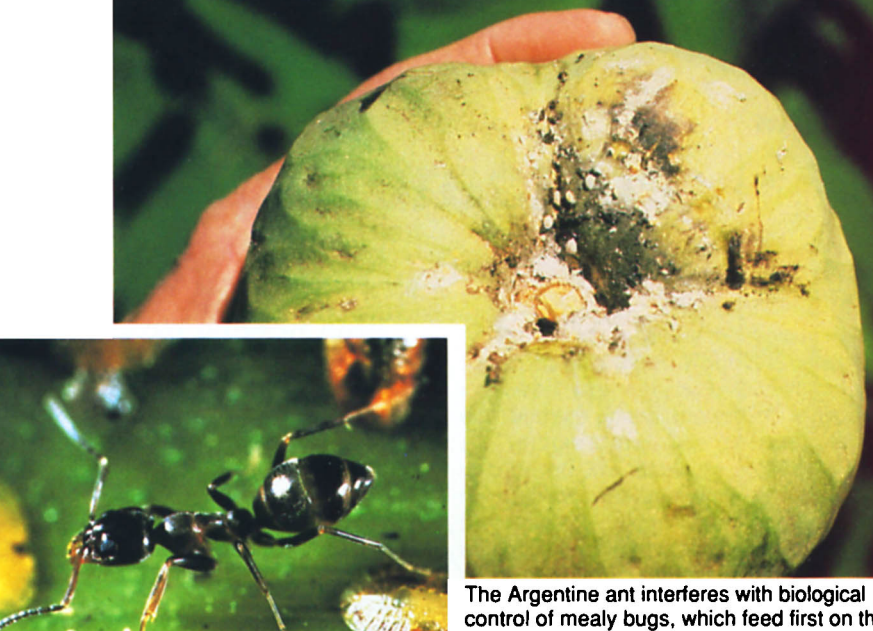
The Argentine ant interferes with biological control of mealy bugs, which feed first on the stem end of cherimoya and eventually may cover the entire fruit.

The model developed here predicts the almond crop more accurately than does the state estimate. Because it is based on a correction of the state estimate for May weather, it can be computed immediately following the state estimate in July. The state estimate is by no means obsolete, however, since it forms the basis for this model.