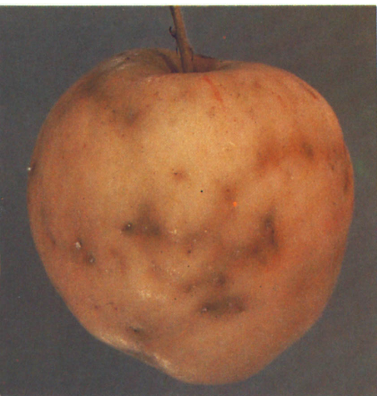
Apple maggot damage proceeds more rapidly and is more severe in softer fleshed, earlier maturing cultivars.