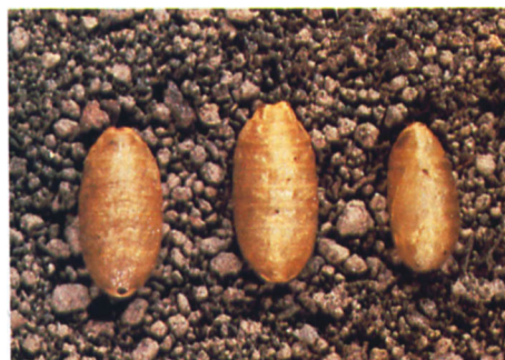
Maggots drop to ground after feeding, burrow into the soil, and molt into pupal stage. After diapause, pupae give rise to a new generation of flies.

Injury to apples varies, depending on the cultivar and the time of attack. In softer-fleshed fruit, the egg-laying punc-