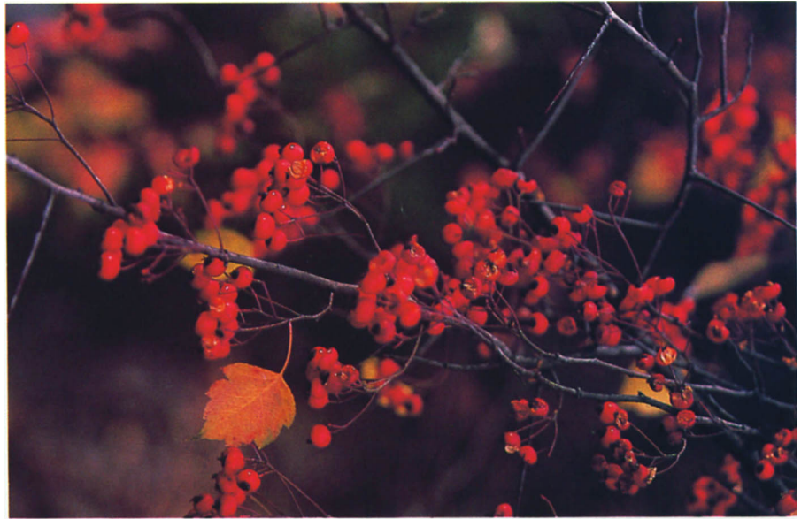
Of the 165 hawthorn species in the United States that are the apple maggot's native host, only western black hawthorn grows in California. Other hybrid varieties may also be hosts.

From the distribution of the apple maggot in the eastern United States, there is no doubt that it can survive in California. How important apple maggot