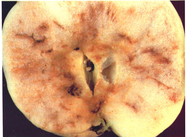
Young larvae leave threadlike trails in fruit. As larvae grow, tunnels become larger, bacterial decay sets in, and apple becomes soft and rotten.