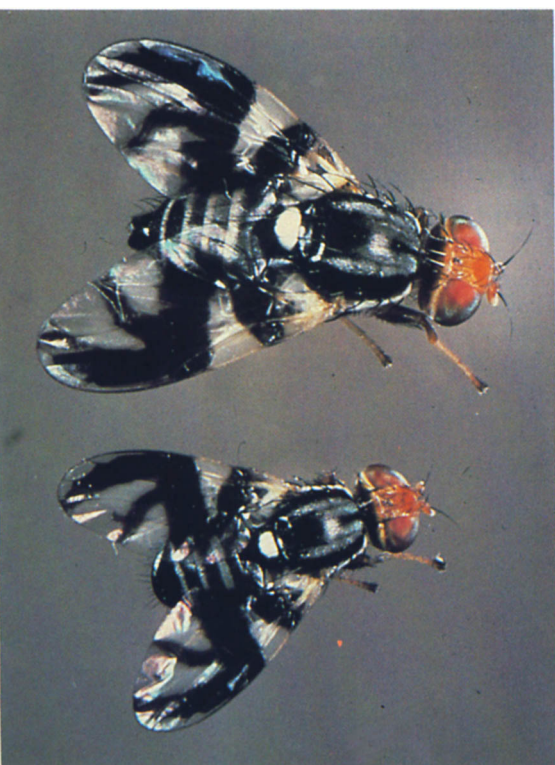
About the same size as a house fly, adult apple maggot fruit flies have a pronounced white spot on the back of the thorax. There are four light-colored crossbands on the female abdomen, three on the somewhat smaller male. Wings are clear with black bands.

Containment appears feasible, but chances for eradication are uncertain