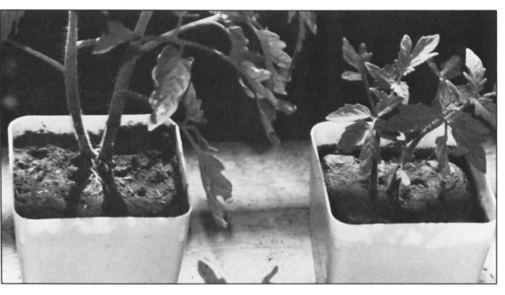
Plant growth in stabilized soil (left) compared with nonstabilized soil. Both had been subjected to heavy watering.

In 1981 a simple, mechanical spotsaturation applicator was developed, and preliminary field trials were conducted. Crusting was not a major prob-