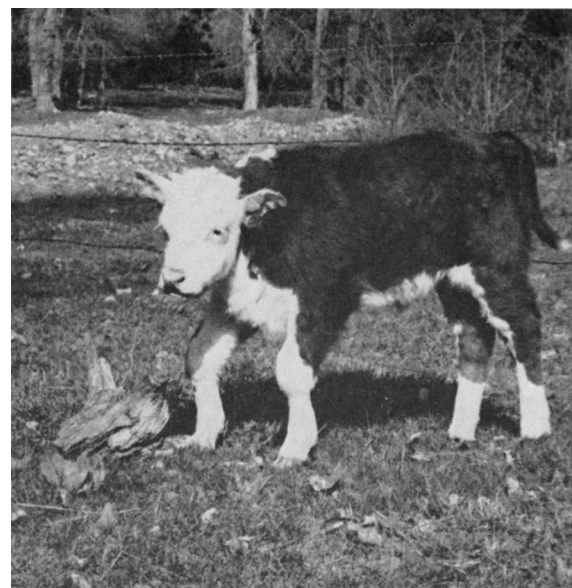
Crooked calf characteristics shown above include enlarged knees on the front legs which are bent forward. The neck also is not natural and shows some effects of this malady.