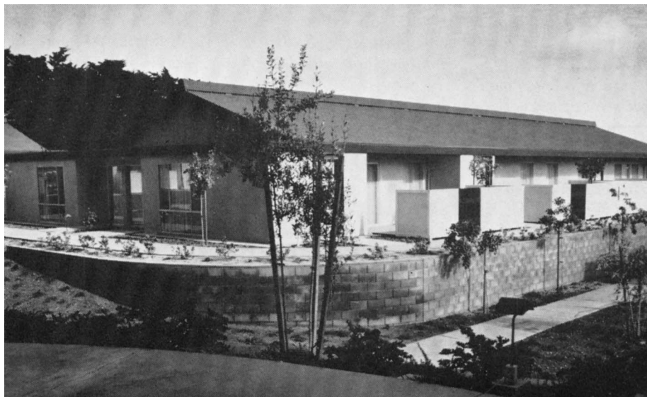
Ground-level frame duplexes at Ventura Town House were also insect-proofed at time of construction (see cover photo).

The application of dust into voids and enclosed places at the time of construction can be done with a water-type fire extinguisher that is now commercially available. The entire contents (3 gallons) of the extinguisher can be blown out with one pressurization with air to 100 p.s.i. This kind of blower generates air of