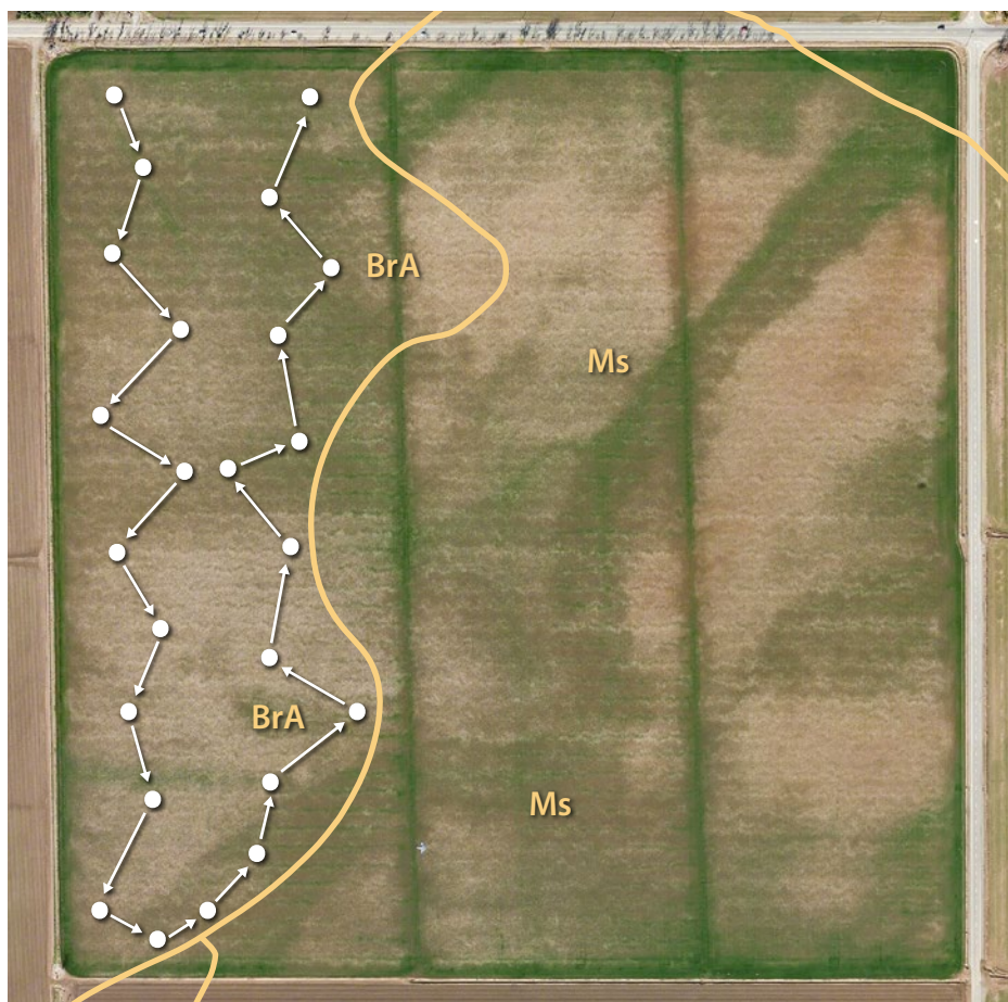
Fig. 2. Soil sampling plan to obtain a representative sample from a field or management area. The sampling points are shown on a Google map using the SoilWeb application (available at casoilresource.lawr.ucdavis.edu/soilweb/ ). The two soil series, Brentwood silty clay (BrA) and Myers clay (MS), are best sampled separately.

Depending on the distribution of nutrients in the soil profile and rooting depth, crops may take up a considerable proportion of nutrients from the soil below the sampled layer. Winter wheat, for example, has been found in one study to acquire 50% of its K from the subsoil (Kuhlmann