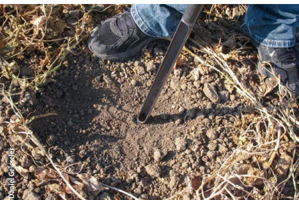
Residue on the soil surface needs to be removed before the soil sample is taken.