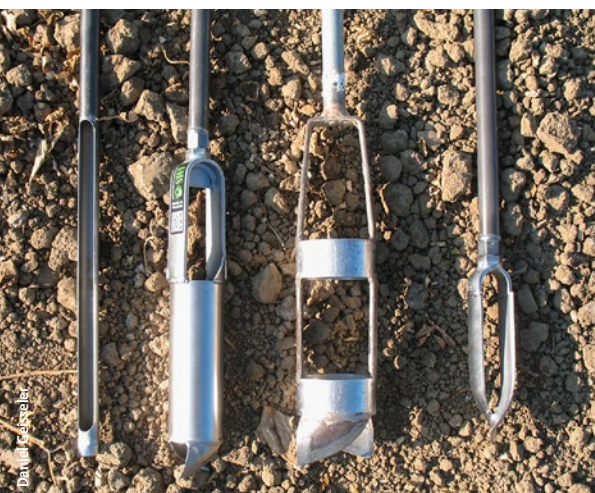
Different tools are available for soil sampling, including (left to right) soil probe, closed bucket auger, open bucket auger and Dutch auger. Under most conditions, the standard soil probe is the best option for most alluvial cultivated soils. Bucket augers work well in stony soils. Open bucket augers are useful in wet clay rich soils. Dutch and Edelman augers may be a better choice than soil probes in stony soils and soils where woody roots are present.