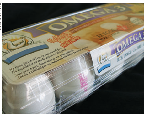
Eggs from chickens that have been fed flax have higher concentrations of omega-3 fatty acids, which have been shown in a number of studies to be beneficial to human health.