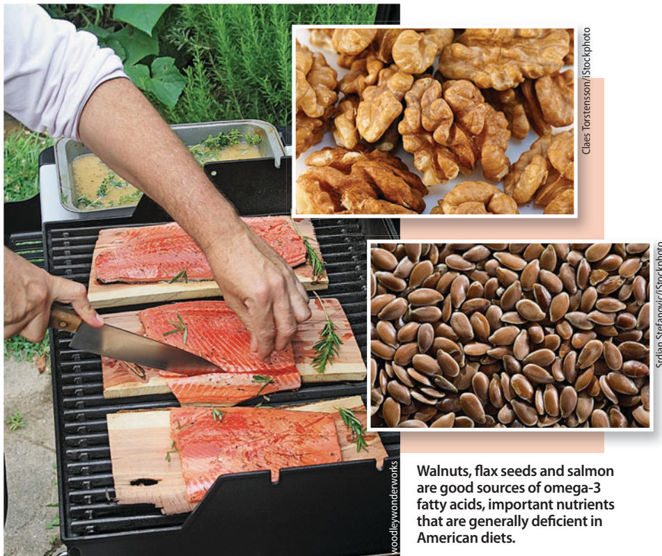
Walnuts, flax seeds and salmon are good sources of omega-3 fatty acids, important nutrients that are generally deficient in American diets.

Saturated and monounsaturated fatty acids, which have no double bonds or a single double bond, respectively, can be synthesized in the liver. In contrast,