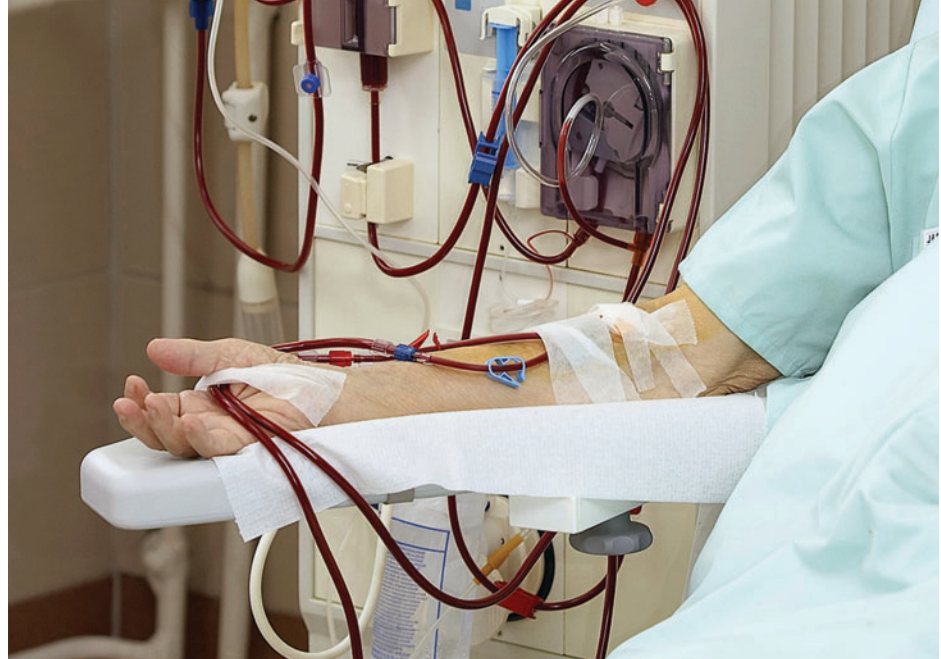
Evidence is mounting that omega-3 fatty acids can moderate inflammation in the body and help reduce the risk and symptoms of kidney disease, heart disease and arthritis. Above, a patient undergoes dialysis for kidney disease.

Even less is known about the optimal plasma concentrations of oxylipins. The normal ranges of omega-3-derived oxylipins were recently reported before versus after supplementation in a small sample of healthy men (Shearer et al. 2009). This is the first such investigation, and while little is known about the concentrations of omega-3 fatty acids