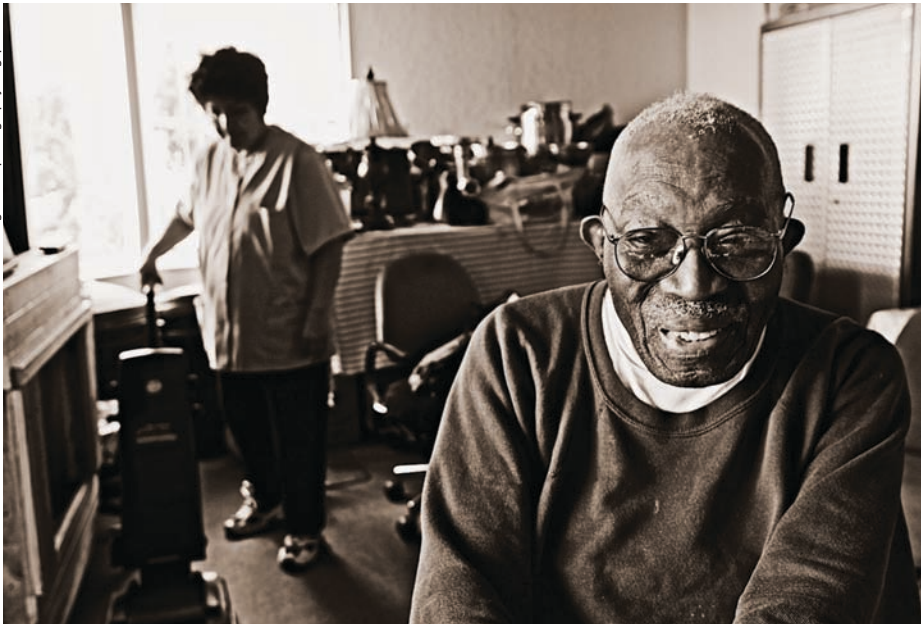
About 400,000 caregivers are registered with California In-Home Supportive Services (IHSS), an agency that screens caregivers, provides orientation and serves as their employer of record. However, training requirements are minimal.

placing caregivers at greater risk for developing or aggravating a number of age-related diseases. Researchers tested blood samples over a 6-year period from a group of caregivers working with Alzheimer's patients. They measured the levels of a naturally produced immune chemical, interleukin-6 (IL-6), which increases with age; high levels are a known risk factor for illnesses such as diabetes, depression, atherosclerosis, rheumatoid arthritis and some cancers. Test results showed that the blood levels of IL-6 increased fourfold among caregivers compared to a control group (Kiecolt-Glaser et al. 1987).