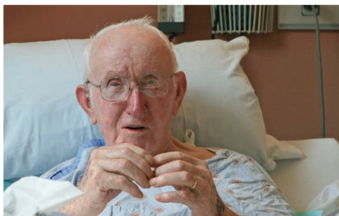
More than 4 million unpaid caregivers provide an estimated $45 billion in services annually. Many take care of family members at home with little support or training.

A large body of research shows that stress associated with caregiver duties may have negative impacts on their physical and emotional well-being, creating new risk factors for disease among caregivers themselves. The use of untrained workers in roles that potentially affect the quality of life of frail elders and disabled persons poses concerns for the caregivers as well as California's public policymakers, planners and service administrators.