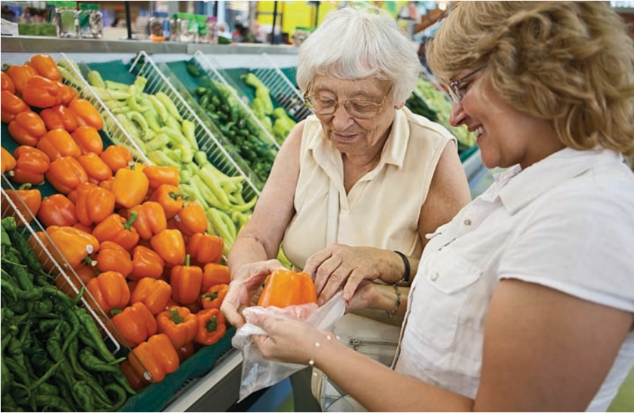
Research is needed to identify the motivational factors that promote engagement among seniors in education related to healthy behaviors, such as eating nutritious foods.

were not magnified as in the first study; in fact, the correlation was slightly attenuated after controlling for motivation ( r = -0.27, P < 0.01 ). These data fail to support the notion that health engagement strategies mitigate age-related declines in nutrition comprehension.