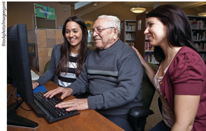
The acquisition of new health information is a function of basic cognitive skills such as working memory and language comprehension, as well as motivational factors.

However, some aspects of language comprehension are compromised in later life due to age-related declines in working memory and related abilities (Norman et al. 1992; van der Linden et al. 1999). Language that is grammatically complex or packed with concepts is particularly difficult for older adults to comprehend (Wingfield and Stine-Morrow 2000). Indeed, some research shows that older adults have more difficulty understanding health information than younger adults (Brown and Park 2002).