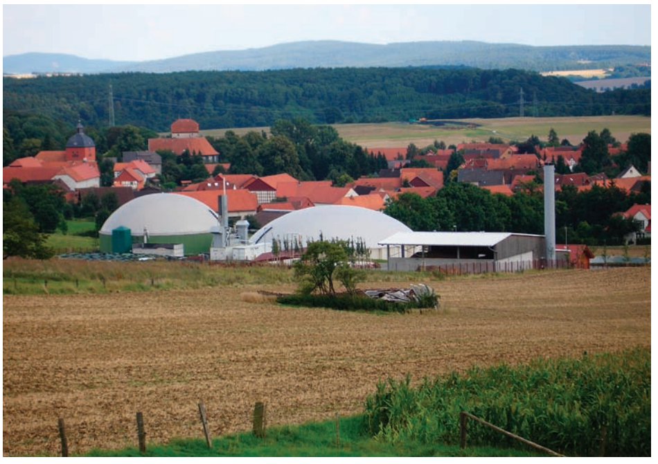
Covered lagoons and methane digesters are an option for reducing greenhouse-gas emissions from dairy waste. In Germany, the village of Juehnde built a digester for livestock waste and other biomass. The methane is combusted to produce electric power and heat for homes in the village, which is the first in the world to go "off the grid" through the use of its own waste.

However, future research is needed to address the mitigation of methane and nitrous oxide from cow enteric fermentation, which we have shown to be the chief of all dairy contributors to climate change.