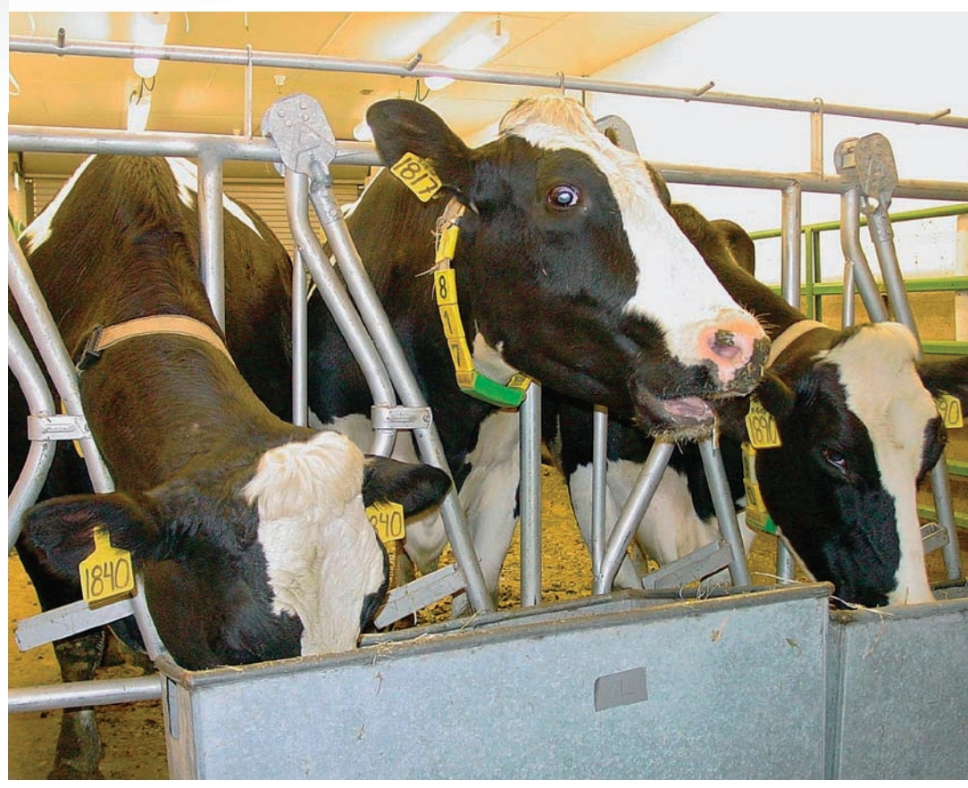
Holstein dairy cows were housed in an environmental chamber for 24 hours to accurately measure all their emissions of greenhouse gases, including methane and nitrous oxide; the cows were fed a total mixed-ration diet.

The three major anthropogenic greenhouse gases are carbon dioxide, methane and nitrous oxide, and agriculture contributes significant amounts of each. The IPCC estimated that globally, agriculture contributed 10% to 12% of anthropogenic carbon dioxide (CO<sub>2</sub>), 40% of methane