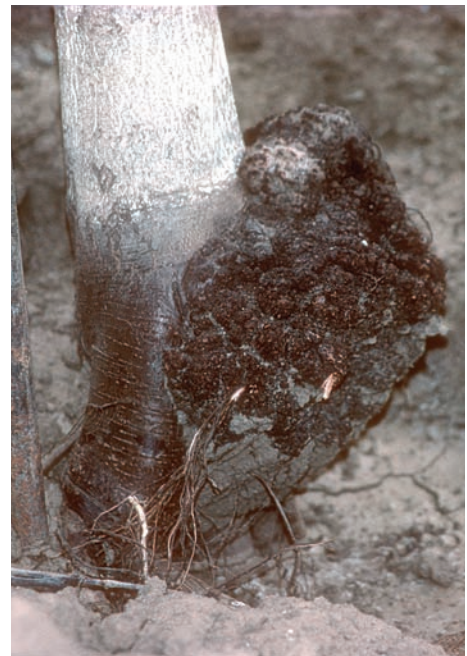
This 2-year-old tree on 'Paradox' rootstock had no gall and was treated with the biocontrol agent K84 at planting. Soil was removed from around the crown to show the gall. Circumstantial evidence indicates that the pathogen was acquired in the nursery.