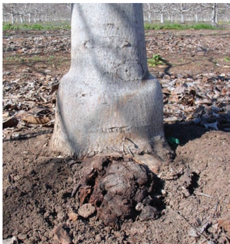
Some galls on the crown eventually break through the soil, but often are not visible in undisturbed soil until 3 or more years after infection. An application of the biocontrol agent K84 in the nursery and/or the orchard only prevents crown gall disease in certain situations, such as when the pathogen is exposed to and sensitive to K84.