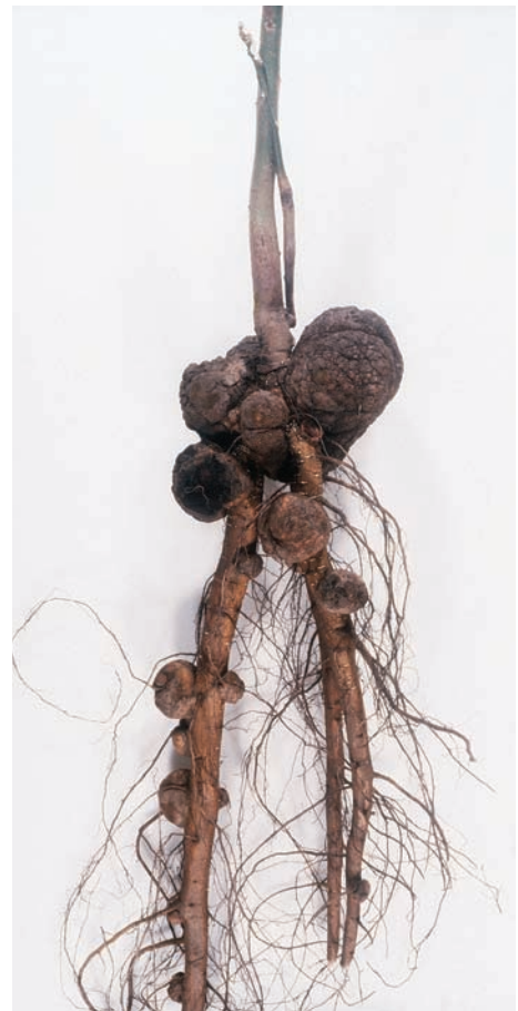
This budded walnut on 'Paradox' rootstock has both crown and root galls. Nurseries do not sell trees with visible galls, but may sell trees with roots that were in direct contact with galls and hence the pathogen.

Before planting, the Yolo County orchard site was fumigated with methyl bromide and chloropicrin, and transplants were treated with the biological control agent K84 (Galltrol, AgBioChem Inc., Orinda, Calif.). The San Joaquin County site, formerly planted with field and row crops, was not fumigated before planting and the transplants were treated with K84 before planting. In fall 2002, trees ( n = 119 to 127 per initial nursery-storage group) with galls that protruded above the soil were counted in both orchards. The Fresno County site was a nematode screening trial in soil amended with two species of nematodes that infect walnuts, Pratylenchus vulnus and Meloidogyne incognita . The