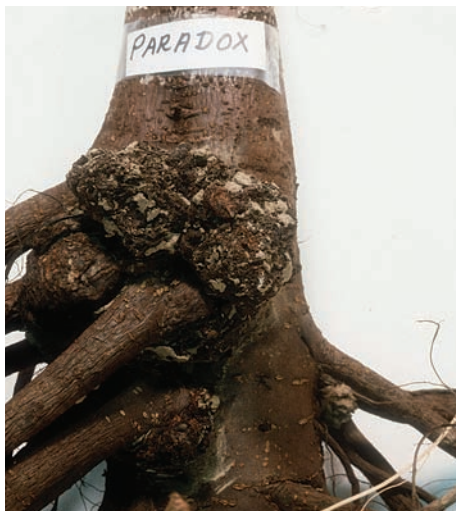
A 2-year-old walnut tree on 'Paradox' rootstock transplanted into soil infested with the pathogen Agrobacterium tumefaciens shows crown galls. Galls were primarily located at the sites of natural wounds such as root emergence, and were rarely observed on pruning wounds or cuts.