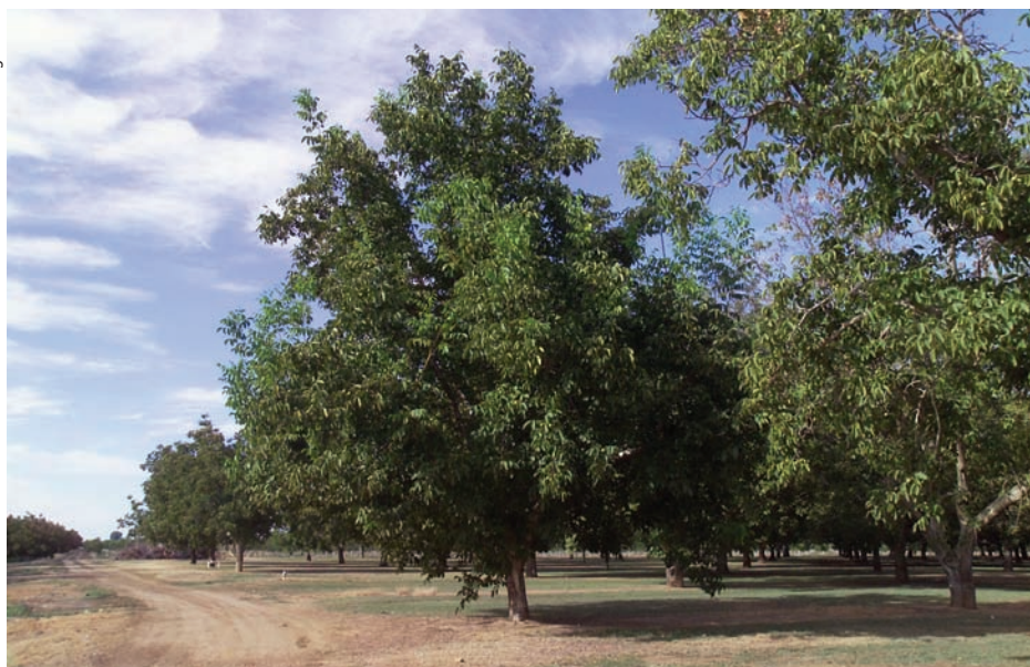
Most California walnut orchards are ‘English’ walnuts grafted onto ‘Paradox’ rootstock, which is highly susceptible to crown gall disease.