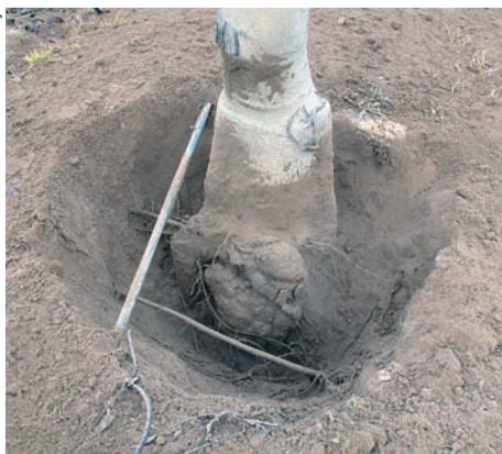
Severe crown gall in a young walnut orchard causes tree stunting and yield reductions. This gall was only visible after soil removal.