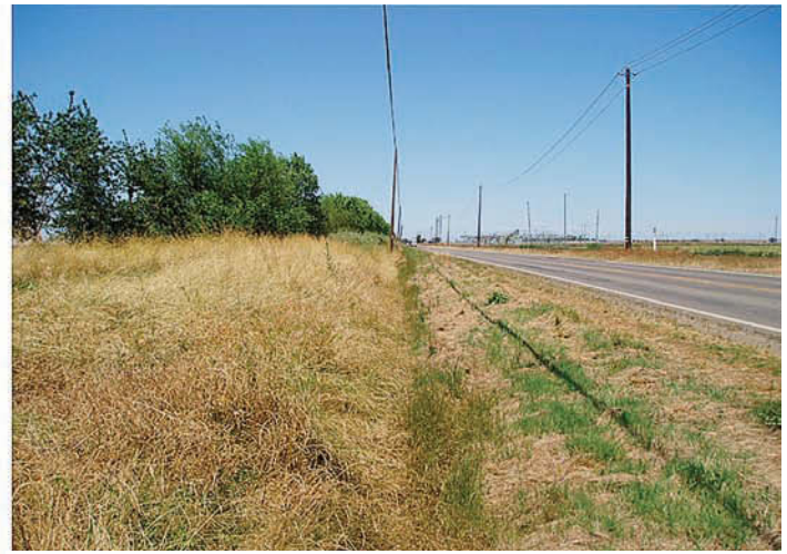
Vegetation cover on the road edge and shoulder (bottom right to center) of site 3 (looking north) is low. Low mowing on the shoulder has resulted in a monoculture stand of Bermuda grass ( Cynodon dactylon ), an invasive perennial. The narrow swale (bottom center to center) is dominated by Italian ryegrass, an invasive annual. Vegetation on the backslope (bottom left to center) is dominated by the native perennial purple needlegrass, with some invasive annual common vetch.

chose to seed native broadleaf species into their native plantings. Those species included yarrow ( Achillea millefolium ), California poppy ( Eschscholzia californica ), gumplant ( Grindelia camporum ) and lupine ( Lupinus sp.), which were seeded at unknown rates.