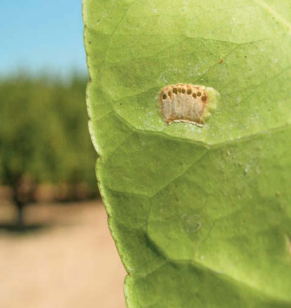
Parasitoid exit holes on a citrus leaf indicate that adults successfully chewed through the egg casing and leaf epidermis to emerge.