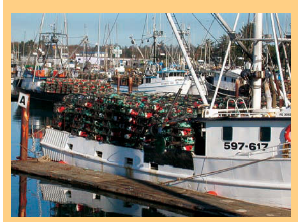
Crab boats loaded with traps in Crescent City, Calif. Far left, a tagged Dungeness crab.

Editor's note: The full text of these award-winning articles can be found online at http://californiaagriculture.ucop.edu/0404OND/toc.html. To purchase back issues, visit the California Agriculture home page.