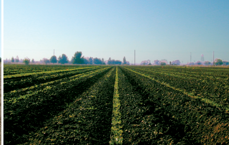
Processing tomato seeds are planted using an autoguidance system. In two trials, total plant damage was 2% and zero when the autoguided cultivator was operated at 7 miles per hour and 2 inches from the plant line.