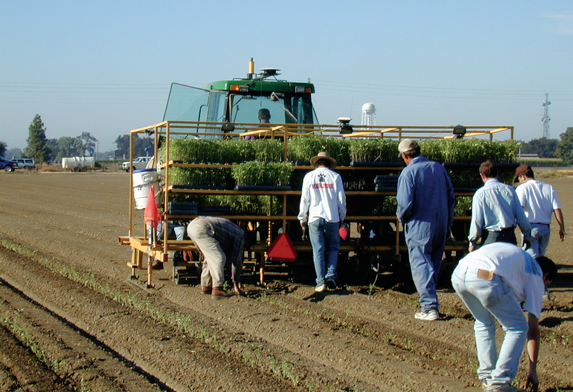
Ultraprecise global positioning systems (GPS) are now available that can guide tractors at high speeds in agricultural fields, running to within inches of plants with very little damage. Above, at UC Davis, tomato seedlings are transplanted using an autoguidance system. The GPS unit is on top of the tractor cab. Left, drip tape is installed at the same time.