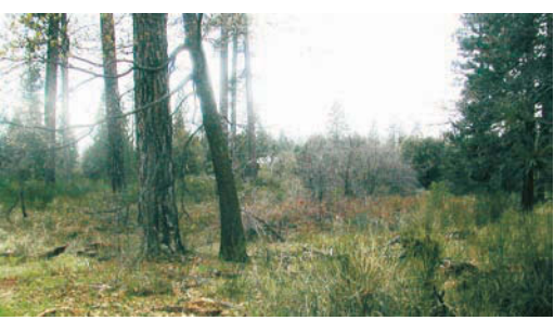
Over the past half-century, the authors found that many of Nevada County's private landowners have allowed their property to be revegetated and reforested following decades of clearing for logging, mining and ranching.

Nevada County is an ideal place to study the effects of exurban inmigration that is transforming many rural areas. The Sierra Nevada is a harbinger of changes occurring throughout rural America, and Nevada County has been among the Sierra region's fastgrowing counties.