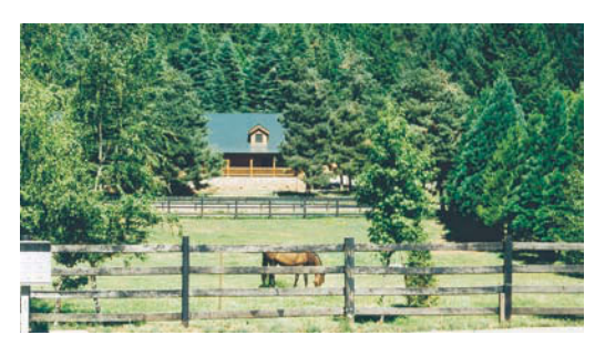
The county's rural landscape is at risk, with 40% of privately owned parcels slated for development. A golf course, 2,000 homes, business park and shopping center are proposed for this 760-acre Northstar property.