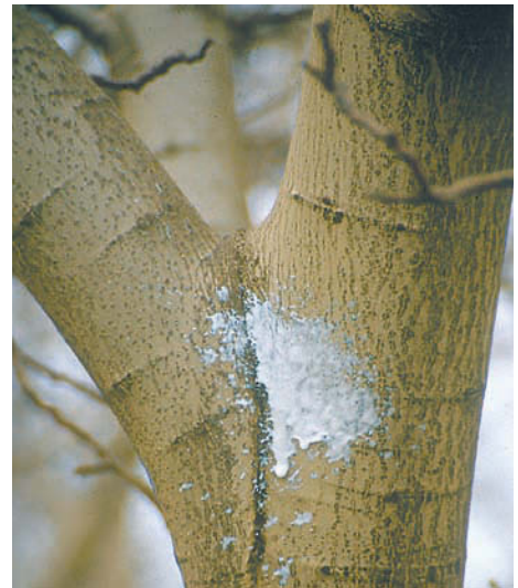
A variety of pheromone mating-disruption products were tested in BIOS and conventional orchards, including a recently developed wax emulsion applied using a pressurized handgun that projects the emulsion near the tops of trees.

A recently developed experimental wax emulsion containing codling moth pheromone (Atterholt et al. 1999; Grant et al. 2001) was made available to our project by the manufacturer (Gowan). We used the product in four BIOS blocks (B, E, F and G) in 1999 and three (B, H and L) in 2000. The pheromone emulsion was applied using a pressurized handgun applicator that projected a precisely metered stream of emulsion onto branches or leaves near the tops of trees. The application rate and concentration were designed to provide