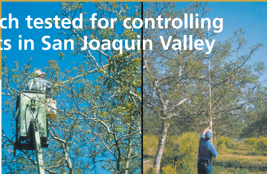
To test the effectiveness of mating disruption in controlling codling moth, pheromone dispensers were applied to walnut trees in the northern San Joaquin Valley. The dispensers must be hung by hand either from a pruning tower, left, or the ground, right.

The Community Alliance with Family Farmers (CAFF), through its innovative Biologically Integrated Orchard Systems (BIOS) project in Yolo and Solano counties, demonstrated from 1996 to 1999 that it is possible to reduce pesticide use and still produce good yields of high-quality walnuts with low levels of pest damage (CAFF 1999). BIOS emphasizes intensive monitoring, biological control and beneficial insect habitat enhancement to control pests; cover crops, animal manures and composts to build soil; and measured use of fertilizers based on nutrient budgeting and leaf tissue anal-