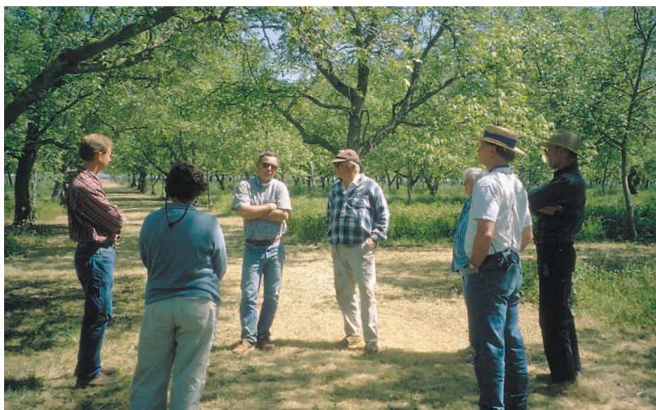
The BIOS implementation team, consisting of growers, UC advisors and technical experts, visited with growers at the beginning of the project to suggest strategies for reducing pesticide use.

* ns = Difference between BIOS and conventional blocks not significant. ss = Significant at P \leq 0.01 .