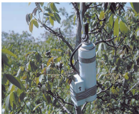
Pheromones can be applied in aerosol form, such as this experimental microsprayer, or "puffer," which releases precise doses at timed intervals.

The pheromone wax emulsion suppressed pheromone trap captures for at least 30 days after application (Grant et al. 2001). Under the relatively low codling-moth pressure conditions that