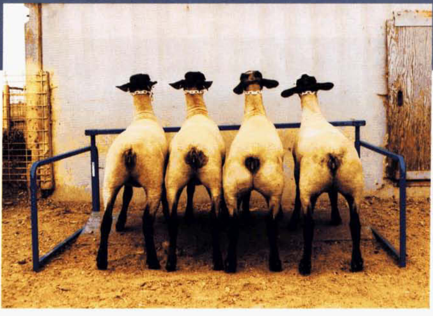
Callipyge lambs (two on right) have enlarged muscles in the hindquarters, compared with normal lambs (two on left). However, their meat is tougher than normal lamb.

slaughter), and must be greater than 50 for lamb to be considered tender.