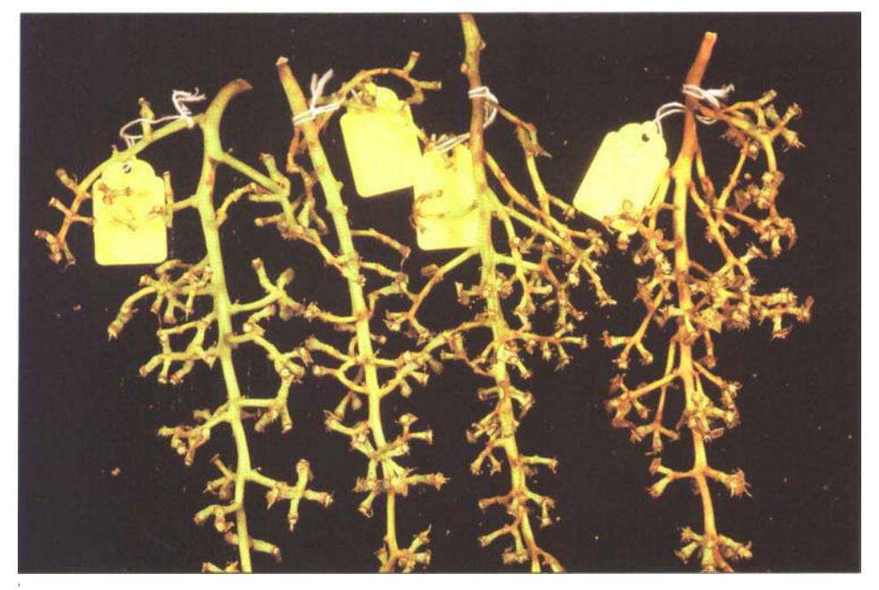
Flame Seedless table grape stem condition after 0, 3, 6 and 9 hours delayed cooling (79°F, 30% rh and 25 fpm air velocity) followed by 7 days cold storage ( 32^{\circ}F , 95% rh and 10 fpm air velocity).

stems with moderate and severe symptoms (table 2). Also, stems with moderate symptoms had lost less of their harvest fresh weight than stems showing severe symptoms. Perlette, Flame Seedless and Thompson Seedless stems had to lose 16.5%, 14.4% and 15.1%, respectively, of their water content before showing cap stem dehydration symptoms. Fantasy Seedless and Redglobe stems needed to lose more than 20% of their water content before showing cap stem dehydration symptoms (table 2). Redglobe stems had moderate to severe stem browning after losing 36% of their water content. Perlette, Flame Seedless, Thompson Seedless and Fantasy Seedless had moderate to severe stem browning symptoms when they lost more than 25% of their stem water content. The fact that Flame Seedless grapes were the first to show dehydration symptoms with 14% stem water loss indicates that this cultivar is more sensitive to stem browning than the others. In contrast, Fantasy Seedless and Redglobe experienced higher levels of stem water loss than Perlette, Flame Seedless and Thompson Seedless be-