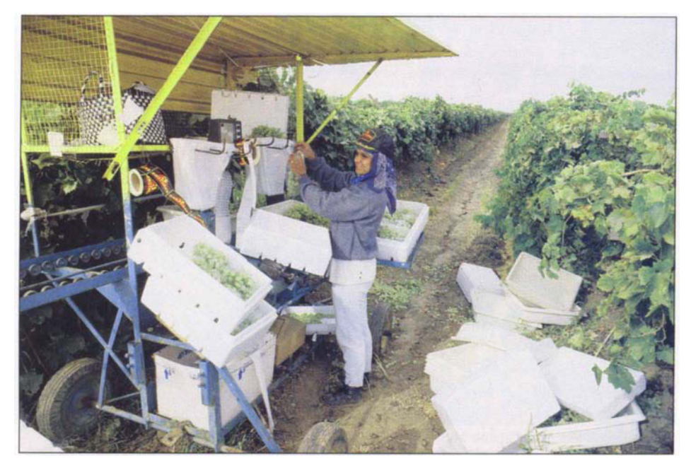
Field packaging of Thompson Seedless table grapes in California.

tween TKV and foam boxes. The greatest water loss during this cooling-delay period (0.96%) was measured in grapes packed in corrugated boxes with and without cluster bags (bulk). Bagged grapes packed in foam boxes lost the least amount of water (0.46%) during this field delay period. The use of cluster bags reduced water losses in all three of the containers tested. The table grapes continued to lose water during fumigation, forced-air cooling and 7 days cold storage (32°F/80% rh). When evaluated at the end of cold storage, only the fruit packed in the foam boxes with cluster bags still had healthy stems. These grapes also lost the least amount of water (1.35%). In all cases, cluster bags reduced water losses during postharvest cold storage (table 4).